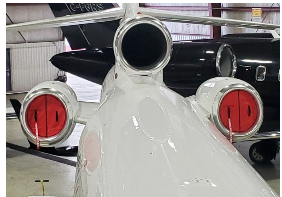
Falcon F7X Outboard Intake Plugs