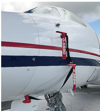
Falcon Jet 7X Pitot Probe/Aoa Set, Heat Resistant Type

The Engine Inlet Plugs are custom fit for your Falcon Jet 7X intakes, made with heavy-duty vinyl material, and stuffed with a single block of sculpted urethane foam. Each plug has a zipper that allows the foam to be removed and dried if necessary. Engine plugs have 'remove before flight' streamers sewn onto the face of the plugs. Most plugs are imprinted with the aircraft registration number in black for an extra charge. Storage bag NOT included. Engine plugs may be inserted after flight when the engine is still warm. Engine Inlet Plugs are commonly referred to as Cowl Plugs, Intake Plugs, Cowl Blocks, Engine Blocks, and Engine Bungs.