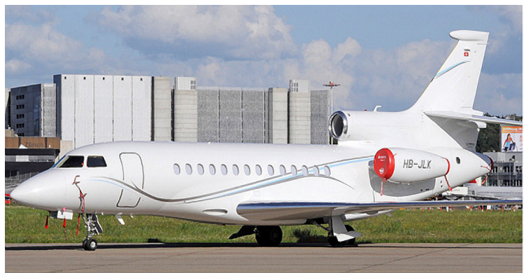
Falcon 7X Engine Covers (Outboard Engines & Center Exhaust)