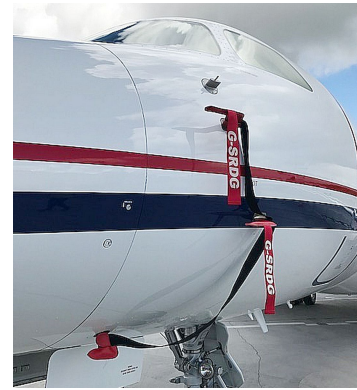
Falcon Jet 7X Pitot Probe/Aoa Set, Heat Resistant Type