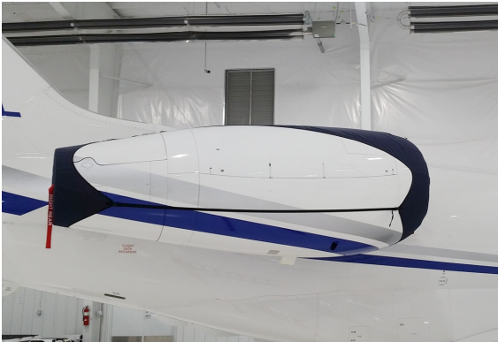
Challenger 300 Intake/Exhaust Cover Set, 3-strap type