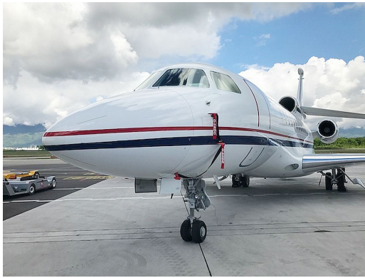
Falcon Jet 7X Pitot Probe/Aoa Set, Heat Resistant Type

The Engine Inlet Plugs are custom fit for your Falcon Jet 6X intakes, made with heavy-duty vinyl material, and stuffed with a single block of sculpted urethane foam. Each plug has a zipper that allows the foam to be removed and dried if necessary. Engine plugs have 'remove before flight' streamers sewn onto the face of the plugs. Most plugs are imprinted with the aircraft registration number in black for an extra charge. Storage bag NOT included. Engine plugs may be inserted after flight when the engine is still warm. Engine Inlet Plugs are commonly referred to as Cowl Plugs, Intake Plugs, Cowl Blocks, Engine Blocks, and Engine Bungs.