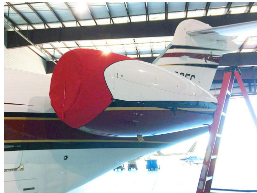
Canadair Challenger 300 Intake/Exhaust Covers, 3-Strap Type