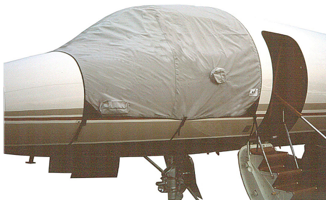
Falcon 50 Windshield Cover

This cover type is made from Silver Acrylic Sunbrella canvas and is 100% lined with a soft and smooth microfiber. Bruce's Custom Covers developed this material combination especially for aircraft protection. The outer material is medium weight and treated for water resistance, UV resistance and anti-static buildup. The inner lining is a very soft and smooth microfiber to prevent scratching. The material is very reflective, and tests show that the cabin interior temperature can be reduced to near-ambient temperature on the hottest of days. It is water, ice and snow repellent, yet breathable to allow moisture to escape from between the cover and the aircraft surface.