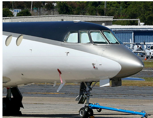
Dassault Falcon 50 Cockpit HeatShields