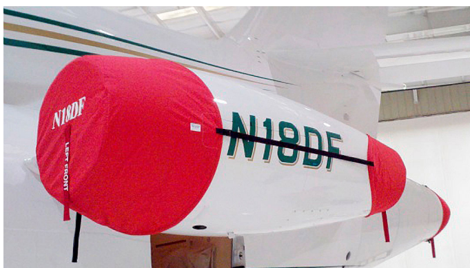
Falcon 900 Engine Cover Set

The Falcon Jet 50EX Bikini Style Engine Covers are a single-piece design using a soft and smooth stretchy and fabric. The cover stretches tightly over both the intake and exhaust, installing quickly and easily. These covers are designed to be used as hangar dust covers and have a useful life of approximately one year.