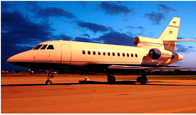
Falcon 900 Engine Covers