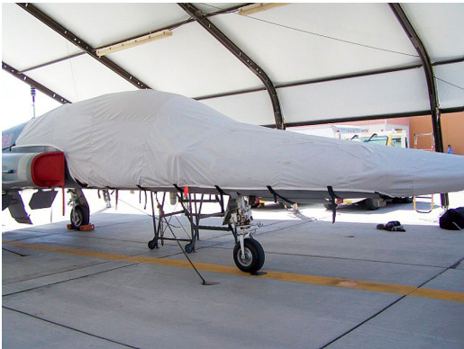
Northrup F5 Talon Canopy Cover