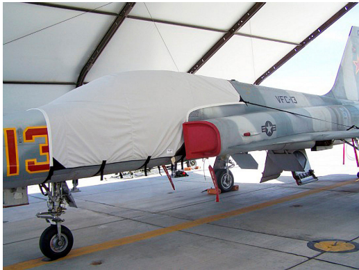
Northrup F5 Talon Canopy Cover

This cover type is made from Silver Acrylic Sunbrella canvas and is 100% lined with a soft and smooth microfiber. Bruce's Custom Covers developed this material combination especially for aircraft protection. The outer material is medium weight and treated for water resistance, UV resistance and anti-static buildup. The inner lining is a very soft and smooth microfiber to prevent scratching. The material is very reflective, and tests show that the cabin interior temperature can be reduced to near-ambient temperature on the hottest of days. It is water, ice and snow repellent, yet breathable to allow moisture to escape from between the cover and the aircraft surface.