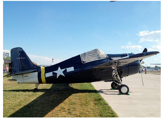
Grumman F4F Wildcat Canopy Cover