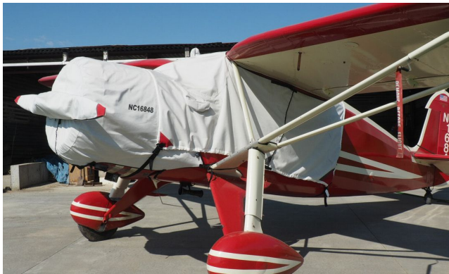
Fairchild 24W Canopy, Engine & Prop Cover

This cover type is made from Silver Acrylic Sunbrella canvas and is 100% lined with a soft and smooth microfiber. Bruce's Custom Covers developed this material combination especially for aircraft protection. The outer material is medium weight and treated for water resistance, UV resistance and anti-static buildup. The inner lining is a very soft and smooth microfiber to prevent scratching. The material is very reflective, and tests show that the cabin interior temperature can be reduced to near-ambient temperature on the hottest of days. It is water, ice and snow repellent, yet breathable to allow moisture to escape from between the cover and the aircraft surface.