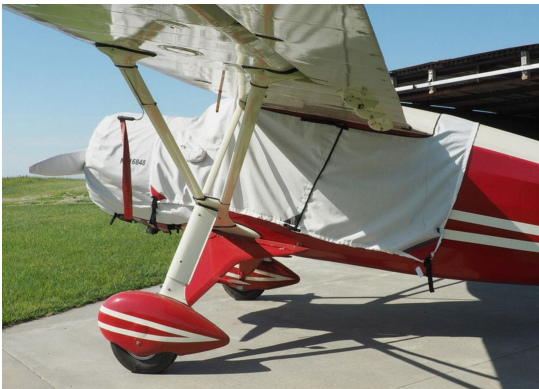
Fairchild 24W Canopy & Engine Cover