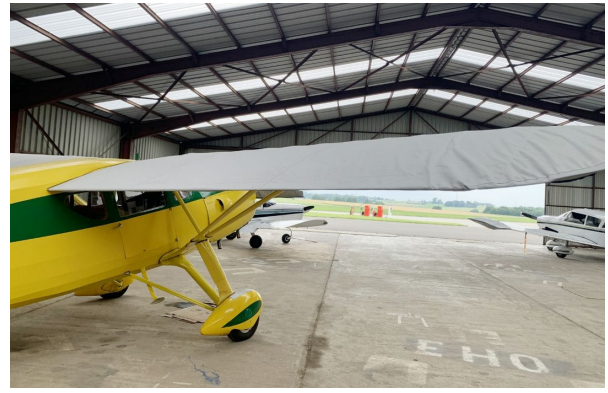
Fairchild 24 Wing Covers