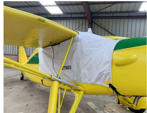
Fairchild 24 Over-Top Canopy Cover