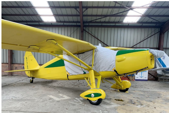
Fairchild 24 Over-Top Canopy Cover, Prop Cover

Travel Covers are made with Silver Solution-Dyed Polyester fabric and only lined over the windshield to save weight. The material is lightweight and more compact for easy stowage in the aircraft. The polyester material is water resistant, but only intended for occasional use outside. We also have an ultra lightweight material available for fitted hangar dust covers. For daily outdoor use, the non-travel Sunbrella Cover is the best choice.