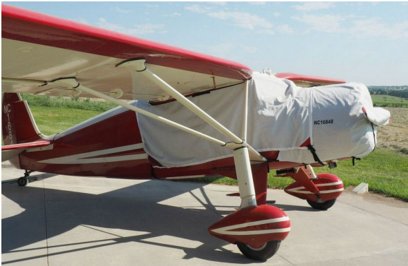
Fairchild 24W Canopy, Engine & Prop Cover

This cover type is made from Silver Acrylic Sunbrella canvas and is 100% lined with a soft and smooth microfiber. Bruce's Custom Covers developed this material combination especially for aircraft protection. The outer material is medium weight and treated for water resistance, UV resistance and anti-static buildup. The inner lining is a very soft and smooth microfiber to prevent scratching. The material is very reflective, and tests show that the cabin interior temperature can be reduced to near-ambient temperature on the hottest of days. It is water, ice and snow repellent, yet breathable to allow moisture to escape from between the cover and the aircraft surface.