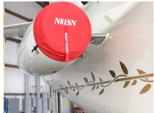
Falcon 900EX Intake Cover