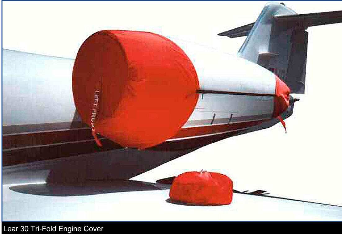
Lear 30 Tri-Fold Engine Cover