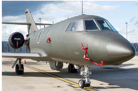
Falcon Engine Covers (not our probe covers)

The Engine Inlet Plugs are custom fit for your Falcon Jet 200 (20H) intakes, made with heavy-duty vinyl material, and stuffed with a single block of sculpted urethane foam. Each plug has a zipper that allows the foam to be removed and dried if necessary. Engine plugs have 'remove before flight' streamers sewn onto the face of the plugs. Most plugs are imprinted with the aircraft registration number in black for an extra charge. Storage bag NOT included. Engine plugs may be inserted after flight when the engine is still warm. Engine Inlet Plugs are commonly referred to as Cowl Plugs, Intake Plugs, Cowl Blocks, Engine Blocks, and Engine Bungs.