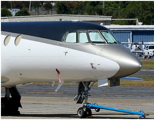
Dassault Falcon 50 Cockpit HeatShields