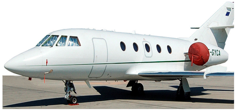
Falcon Engine Cover & Cockpit HeatShields