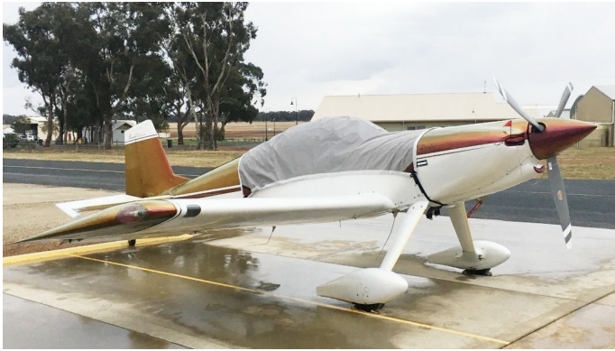
F1 Rocket Travel Cover, Light Weight Travel Canopy Cover, Bubble Windshield, Engine Plugs

Travel Covers are made with Silver Solution-Dyed Polyester fabric and only lined over the windshield to save weight. The material is lightweight and more compact for easy stowage in the aircraft. The polyester material is water resistant, but only intended for occasional use outside. We also have an ultra lightweight material available for fitted hangar dust covers. For daily outdoor use, the non-travel Sunbrella Cover is the best choice.