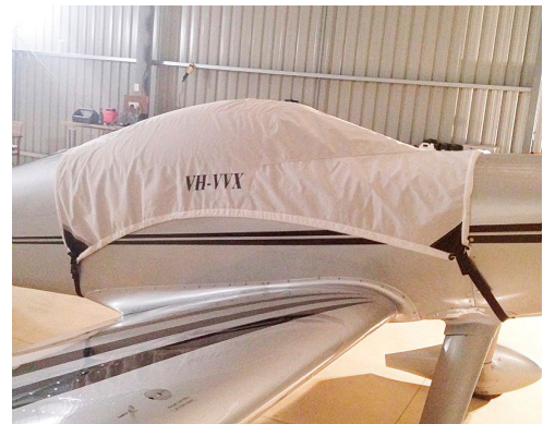
F1 Rocket Canopy Cover