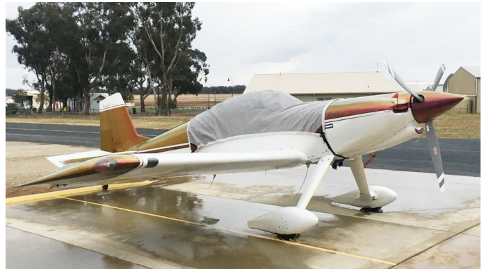
F1 Rocket Travel Cover, Light Weight Travel Canopy Cover, Bubble Windshield, Engine Plugs