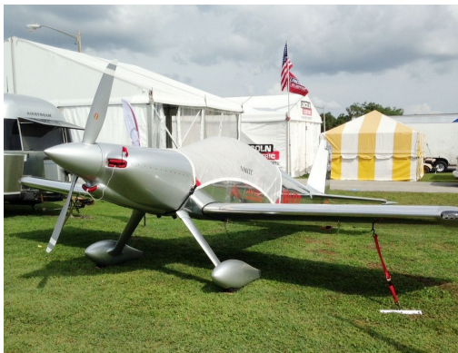
F1 Rocket Canopy Cover, Engine Plugs

This cover type is made from Silver Acrylic Sunbrella canvas and is 100% lined with a soft and smooth microfiber. Bruce's Custom Covers developed this material combination especially for aircraft protection. The outer material is medium weight and treated for water resistance, UV resistance and anti-static buildup. The inner lining is a very soft and smooth microfiber to prevent scratching. The material is very reflective, and tests show that the cabin interior temperature can be reduced to near-ambient temperature on the hottest of days. It is water, ice and snow repellent, yet breathable to allow moisture to escape from between the cover and the aircraft surface.