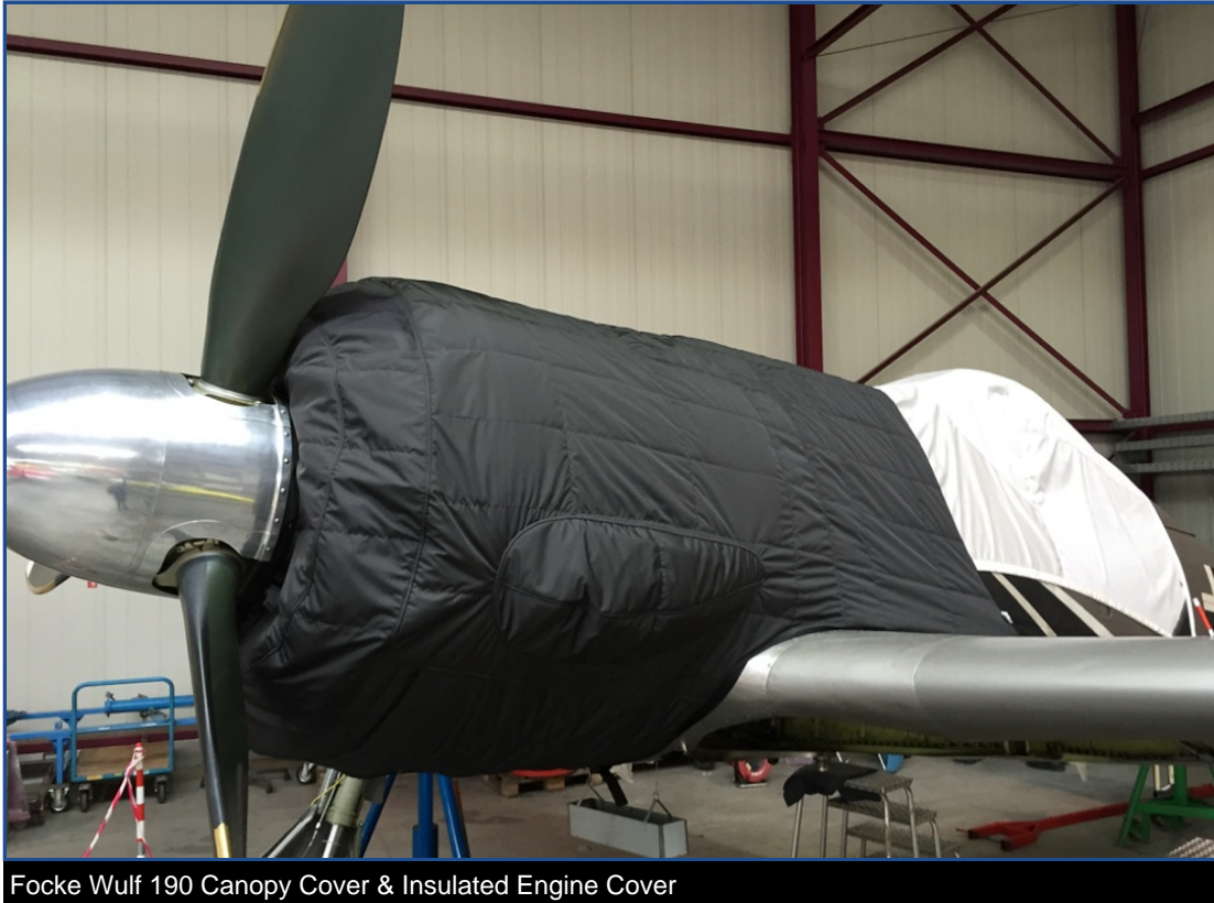
Focke Wulf 190 Canopy Cover &amp; Insulated Engine Cover