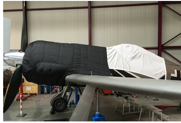
Focke Wulf 190 Canopy Cover & Insulated Engine Cover