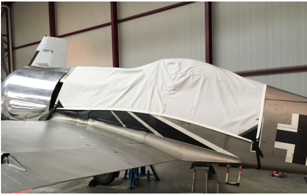
Focke Wulf 190 Canopy Cover