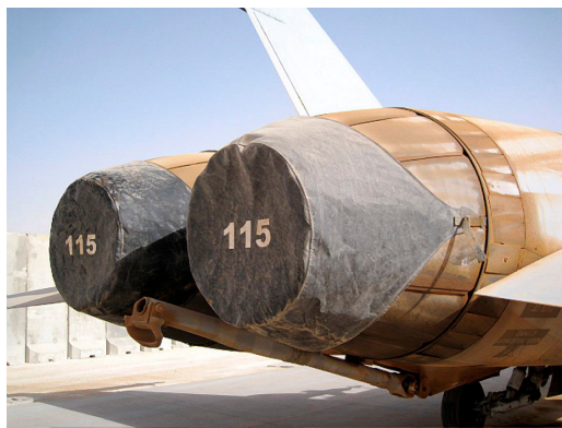
F-18 Exhaust Covers

The McDonnell Douglas F-18 Hornet, Super Hornet Intake Covers are designed to install easily yet be completely storable. A spring steel hoop is sewn into the hem of each cover, allowing them to be installed without climbing onto the wing or using a stepladder. To store the covers the spring steel hoop folds like a band-saw blade into three nesting rings. Each cover folds into a compact circular bundle which is stored in the included duffle bag, yet they unfold quickly for use. The Tri-Fold Ring cover is made of medium weight nylon which is available in a variety of colors to match the paint trim. Each cover set comes complete with installation and folding instructions. The aircraft's registration number can be silkscreened onto the cover for an extra charge.