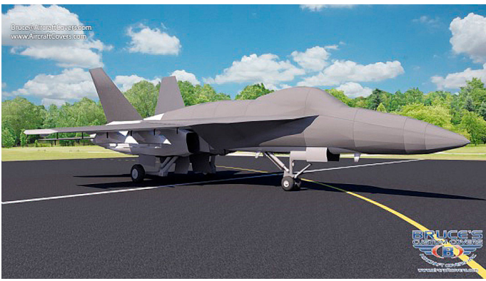
F-18 Storage Covers, 3D rendering