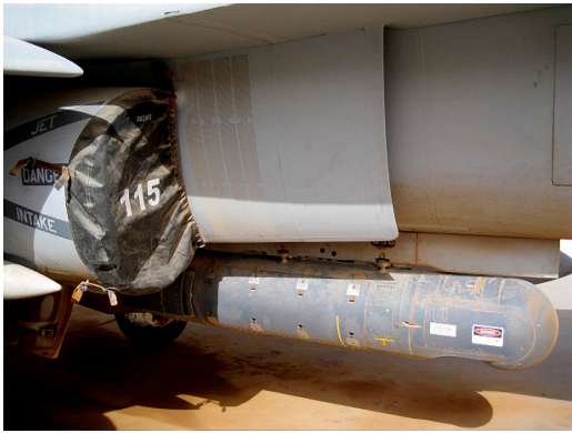
F-18 Intake Covers