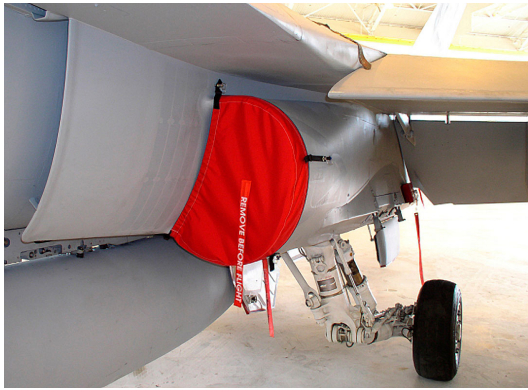
F-18 Engine Inlet Cover

The McDonnell Douglas F-18 Hornet, Super Hornet Intake Covers are designed to install easily yet be completely storable. A spring steel hoop is sewn into the hem of each cover, allowing them to be installed without climbing onto the wing or using a step ladder. To store the covers the spring steel hoop folds like a band-saw blade into three nesting rings. Each cover folds into a compact circular bundle which is stored in the included duffle bag, yet they unfold quickly for use. The Tri-Fold Ring cover is made of medium weight nylon which is available in a variety of colors to match the paint trim. Each cover set comes complete with installation and folding instructions. The aircraft's registration number can be silkscreened onto the cover for an extra charge.