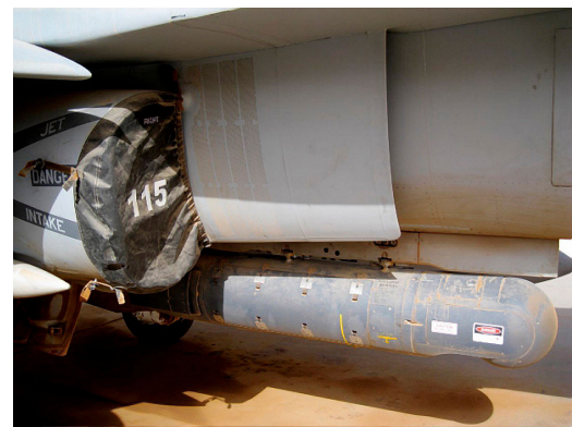
F-18 Intake Covers