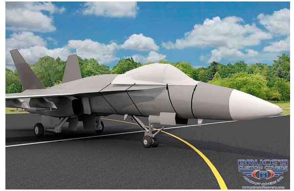
F-18 Canopy Cover, illustration