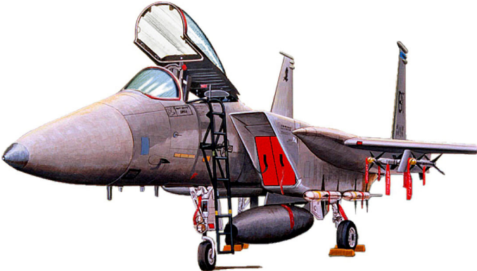
F15 Cockpit HeatShields & Intake Plugs