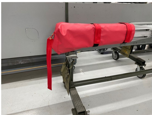
McDonnell Douglas F-15 Launcher Rail Cover

ALL-YEAR USE MATERIAL - Made with Silver Acrylic Sunbrella canvas, the all-year use material is the best option for sun protection and cover longevity. This heavier more durable material is intended for all weather conditions, such as rain and snow or lots of sun.