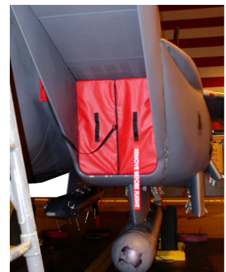
F15 Intake Plugs