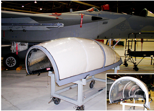
F-15 Cockpit HeatShield

Heatshields are interior sunshades for an aircraft's windows or canopy glass. The product is a unique composite of closed-cell foam with a silver mylar finish. The semi-rigid design is stiff enough to stand along the inside of the windshield using sun visors or window framing. It folds up flat and easily stores in the included storage sleeve. Some designs may require velcro and suction cups. A Heatshield is an excellent short-term remedy for cockpit overheating.