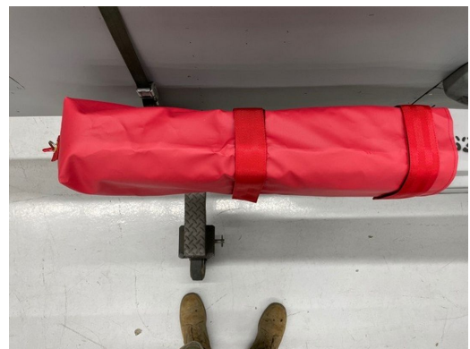
McDonnell Douglas F-15 Launcher Rail Cover