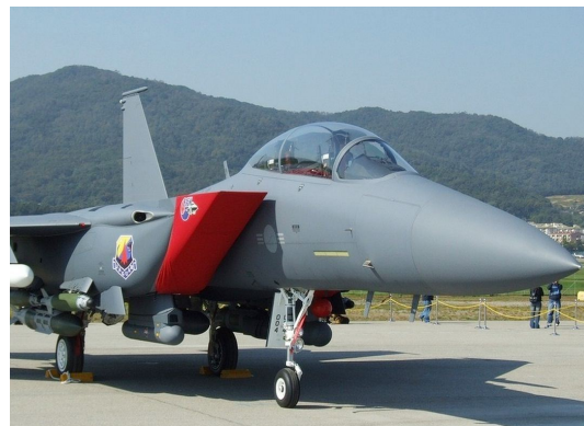
McDonnell Douglas F-15 Eagle Engine Inlet Covers