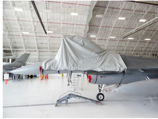
F-16 CANOPY COVER, OPEN POSITION (C-Model, single seat models)