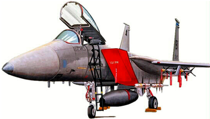
F15 Cockpit HeatShields & Inlet Cover

Heatshields are interior sunshades for an aircraft's windows or canopy glass. The product is a unique composite of closed-cell foam with a silver mylar finish. The semi-rigid design is stiff enough to stand along the inside of the windshield using sun visors or window framing. It folds up flat and easily stores in the included storage sleeve. Some designs may require velcro and suction cups. A Heatshield is an excellent short-term remedy for cockpit overheating.