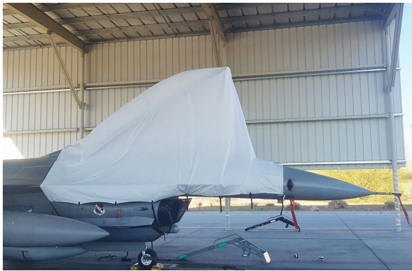
McDonnell Douglas F16-D Canopy Cover, open cockpit type (test fit cover)

Canopy Covers are commonly referred to as Cabin Covers, Fuselage Covers, Canvas Covers, Canopy Caps, etc.