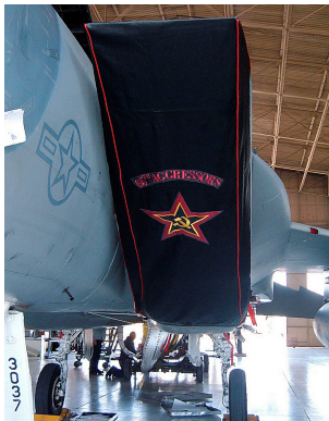
F15 Intake Cover