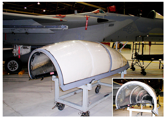
F-15 Cockpit HeatShield