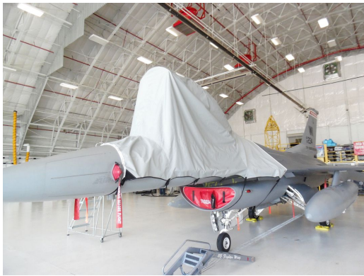
F-16 CANOPY COVER, OPEN POSITION (C-Model, single seat models)