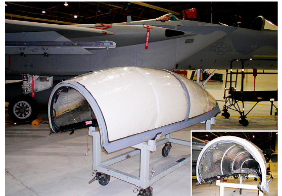
F-15 Cockpit HeatShield