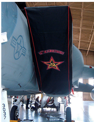
F15 Intake Cover

The McDonnell Douglas F-15 Eagle Intake Covers are designed to install easily yet be completely storable. A spring steel hoop is sewn into the hem of each cover, allowing them to be installed without climbing onto the wing or using a stepladder. To store the covers the spring steel hoop folds like a band-saw blade into three nesting rings. Each cover folds into a compact circular bundle which is stored in the included duffel bag, yet they unfold quickly for use. The Tri-Fold Ring cover is made of medium weight nylon which is available in a variety of colors to match the paint trim. Each cover set comes complete with installation and folding instructions. The aircraft's registration number can be silkscreened onto the cover for an extra charge.