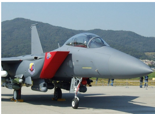
McDonnell Douglas F-15 Eagle Engine Inlet Covers

The McDonnell Douglas F-15 Eagle Intake Covers are designed to install easily yet be completely storable. A spring steel hoop is sewn into the hem of each cover, allowing them to be installed without climbing onto the wing or using a stepladder. To store the covers the spring steel hoop folds like a band-saw blade into three nesting rings. Each cover folds into a compact circular bundle which is stored in the included duffle bag, yet they unfold quickly for use. The Tri-Fold Ring cover is made of medium weight nylon which is available in a variety of colors to match the paint trim. Each cover set comes complete with installation and folding instructions. The aircraft's registration number can be silkscreened onto the cover for an extra charge.