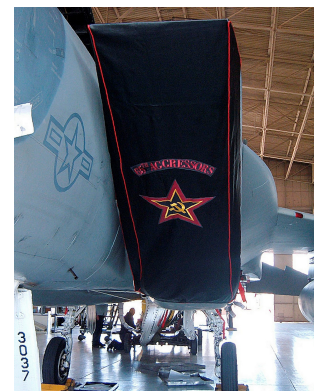
F15 Intake Cover