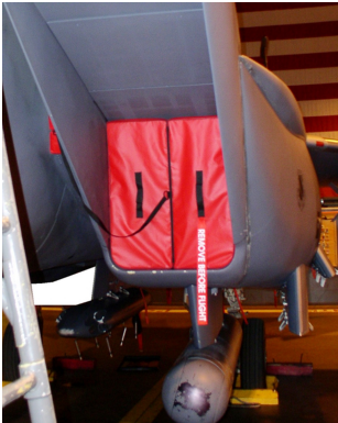
F15 Intake Plugs

The Engine Inlet Plugs are custom fit for your McDonnell Douglas F-15 Eagle intakes, made with heavy-duty vinyl material, and stuffed with a single block of sculpted urethane foam. Each plug has a zipper that allows the foam to be removed and dried if necessary. Engine plugs have 'remove before flight' streamers sewn onto the face of the plugs. Most plugs are imprinted with the aircraft registration number in black for an extra charge. Storage bag NOT included. Engine plugs may be inserted after flight when the engine is still warm. Engine Inlet Plugs are commonly referred to as Cowl Plugs, Intake Plugs, Cowl Blocks, Engine Blocks, and Engine Bungs.