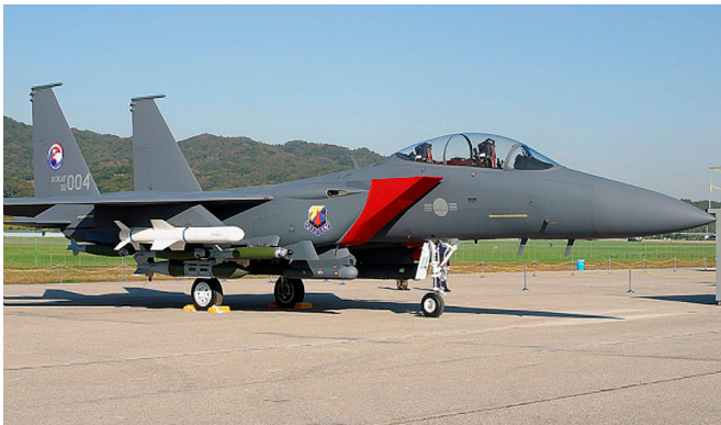
Intake Cover, F15-K

The McDonnell Douglas F-15 Eagle Intake Covers are designed to install easily yet be completely storable. A spring steel hoop is sewn into the hem of each cover, allowing them to be installed without climbing onto the wing or using a stepladder. To store the covers the spring steel hoop folds like a band-saw blade into three nesting rings. Each cover folds into a compact circular bundle which is stored in the included duffle bag, yet they unfold quickly for use. The Tri-Fold Ring cover is made of medium weight nylon which is available in a variety of colors to match the paint trim. Each cover set comes complete with installation and folding instructions. The aircraft's registration number can be silkscreened onto the cover for an extra charge.