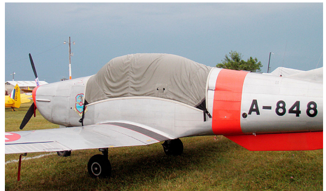
Piaggio P-149D Trainer Canopy Cover