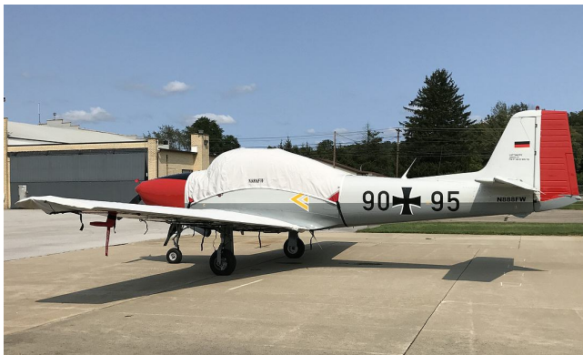
Focke Wulf F149 Canopy Cover, Wing Covers

of the Canopy Cover and Engine Cover. This cover will enclose the engine cowl and will extend aft to cover all of the windows. This cover type is made from Silver Acrylic Sunbrella canvas and is 100% lined with a soft and smooth microfiber. Bruce's Custom Covers developed this material combination especially for aircraft protection. The outer material is medium weight and treated for water resistance, UV resistance and anti-static buildup. The inner lining is a very soft and smooth microfiber to prevent scratching. The material is very reflective, and tests show that the cabin interior temperature can be reduced to near-ambient temperature on the hottest of days. It is water, ice and snow repellent, yet breathable to allow moisture to escape from between the cover and the aircraft surface.