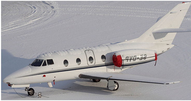
Falcon Jet Engine Intake/Exhaust Cover Set