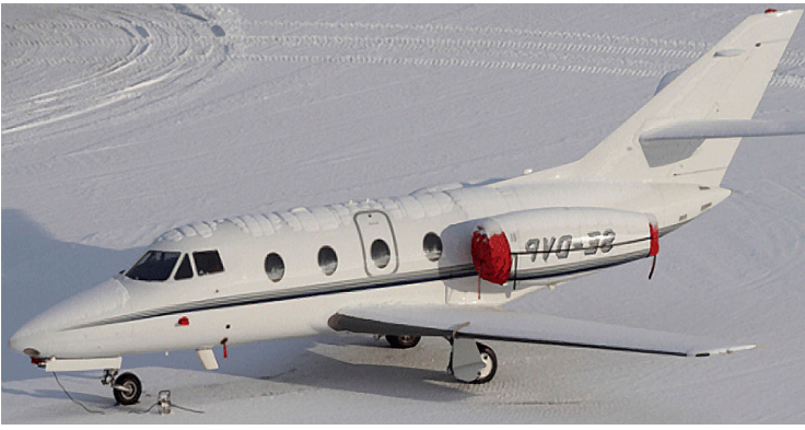
Falcon Jet Engine Intake/Exhaust Cover Set