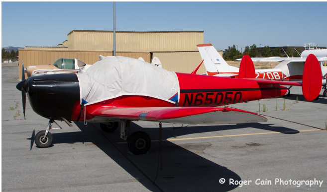
Ercoupe Canopy Cover

Travel Covers are made with Silver Solution-Dyed Polyester fabric and only lined over the windshield to save weight. The material is lightweight and more compact for easy stowage in the aircraft. The polyester material is water resistant, but only intended for occasional use outside. We also have an ultra lightweight material available for fitted hangar dust covers. For daily outdoor use, the non-travel Sunbrella Cover is the best choice.