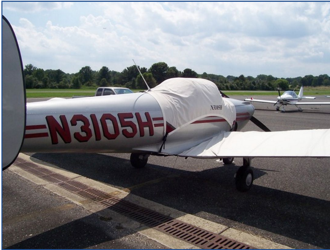
Ercoupe Canopy Cover