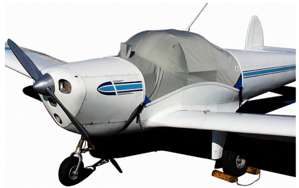
Ercoupe Canopy Cover, bubble windshield model