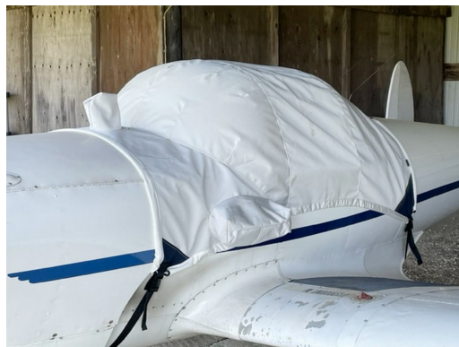
ERCOUPE 415-C Canopy Cover