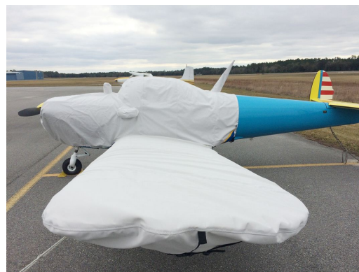
Ercoupe Extended Canopy/Engine Cover, and Wing Covers