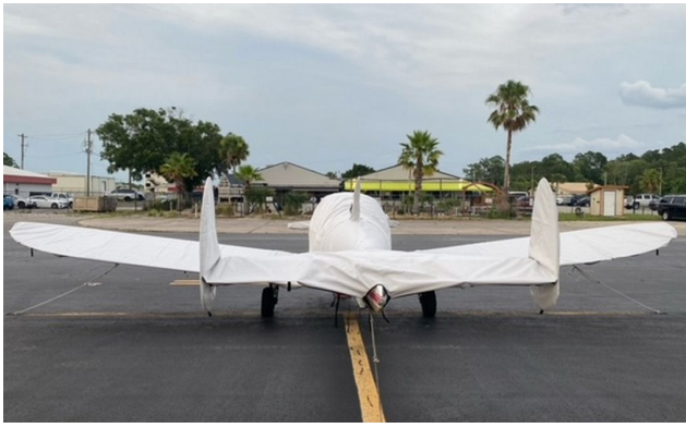
Ercoupe Complete Cover Set