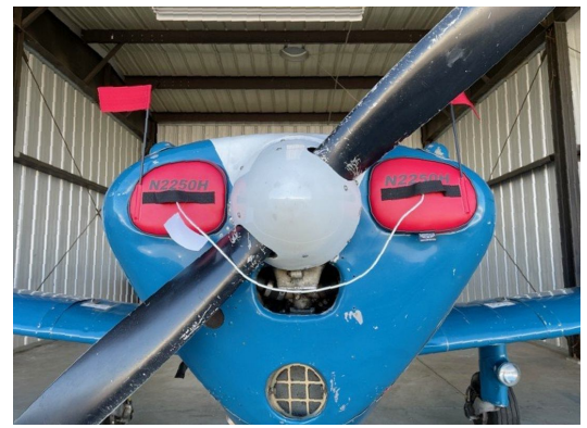
Ercoupe Engine Plugs