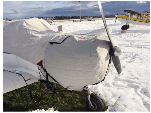
Ercoupe Insulated Engine Cover