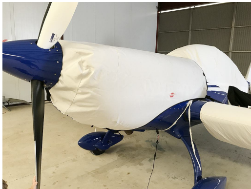
Extra 300, 330SC & 200/230 Models Engine Cover

This cover type is made from Silver Acrylic Sunbrella canvas and is 100% lined with a soft and smooth microfiber. Bruce's Custom Covers developed this material combination especially for aircraft protection. The outer material is medium weight and treated for water resistance, UV resistance and anti-static buildup. The inner lining is a very soft and smooth microfiber to prevent scratching. The material is very reflective, and tests show that the cabin interior temperature can be reduced to near-ambient temperature on the hottest of days. It is water, ice and snow repellent, yet breathable to allow moisture to escape from between the cover and the aircraft surface.