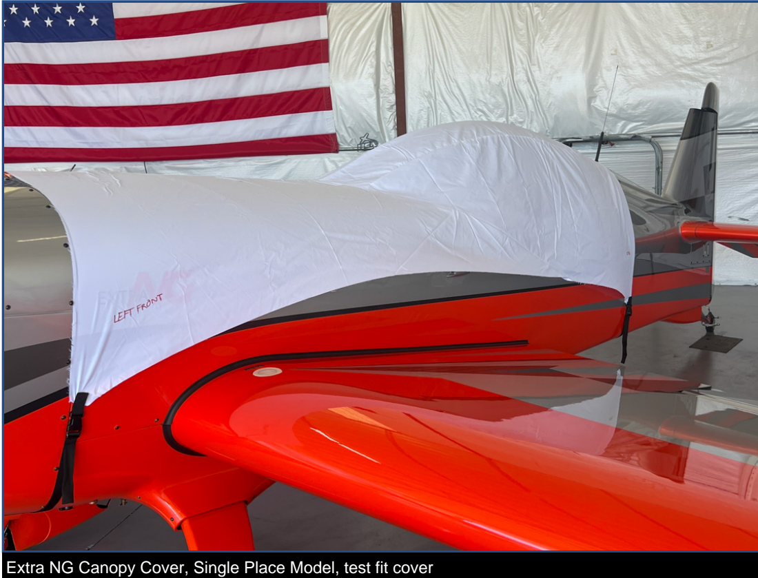
Extra NG Canopy Cover, Single Place Model, test fit cover