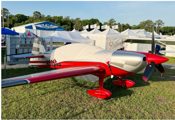
Extra NG Canopy Cover

This cover type is made from Silver Acrylic Sunbrella canvas and is 100% lined with a soft and smooth microfiber. Bruce's Custom Covers developed this material combination especially for aircraft protection. The outer material is medium weight and treated for water resistance, UV resistance and anti-static buildup. The inner lining is a very soft and smooth microfiber to prevent scratching. The material is very reflective, and tests show that the cabin interior temperature can be reduced to near-ambient temperature on the hottest of days. It is water, ice and snow repellent, yet breathable to allow moisture to escape from between the cover and the aircraft surface.