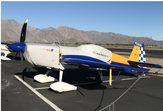
Extra 300S Canopy & Engine Covers

This cover type is made from Silver Acrylic Sunbrella canvas and is 100% lined with a soft and smooth microfiber. Bruce's Custom Covers developed this material combination especially for aircraft protection. The outer material is medium weight and treated for water resistance, UV resistance and anti-static buildup. The inner lining is a very soft and smooth microfiber to prevent scratching. The material is very reflective, and tests show that the cabin interior temperature can be reduced to near-ambient temperature on the hottest of days. It is water, ice and snow repellent, yet breathable to allow moisture to escape from between the cover and the aircraft surface.