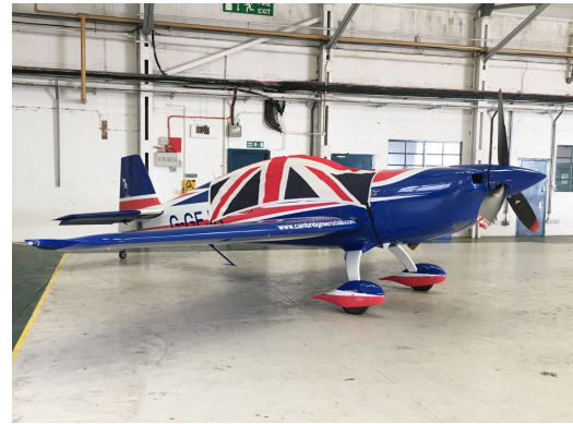
Extra 330 Canopy Cover, custom design