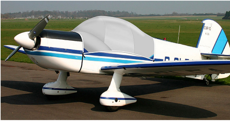
Mudry CAP 10 Canopy Cover (Illustration)

the hottest of days. It is water, ice and snow repellent, yet breathable to allow moisture to escape from between the cover and the aircraft surface.