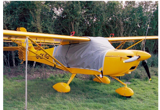
EUROFOX 3K Light Weight Travel Canopy Cover