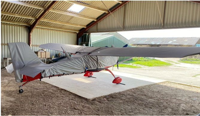
Eurofox Complete Cover Set

This cover type is made from Silver Acrylic Sunbrella canvas and is 100% lined with a soft and smooth microfiber. Bruce's Custom Covers developed this material combination especially for aircraft protection. The outer material is medium weight and treated for water resistance, UV resistance and anti-static buildup. The inner lining is a very soft and smooth microfiber to prevent scratching. The material is very reflective, and tests show that the cabin interior temperature can be reduced to near-ambient temperature on the hottest of days. It is water, ice and snow repellent, yet breathable to allow moisture to escape from between the cover and the aircraft surface.