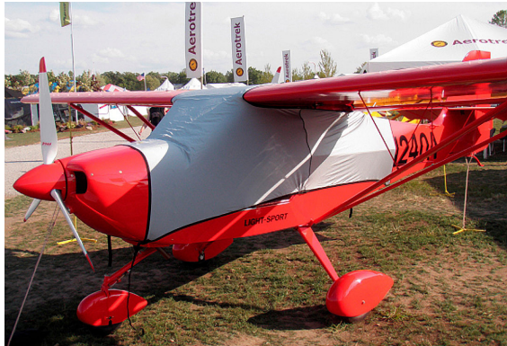
Aerotrek A240 Spandex FlyAway Travel Canopy Cover