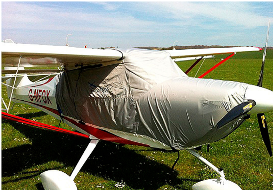
EuroFox and Aerotrek A240 Lightweight Travel Canopy/Engine Cover

Travel Covers are made with Silver Solution-Dyed Polyester fabric and only lined over the windshield to save weight. The material is lightweight and more compact for easy stowage in the aircraft. The polyester material is water resistant, but only intended for occasional use outside. We also have an ultra lightweight material available for fitted hangar dust covers. For daily outdoor use, the non-travel Sunbrella Cover is the best choice.