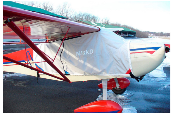
Kitfox IV Over-the-top Canopy Cover