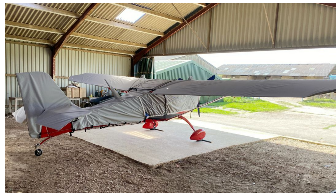
Eurofox Complete Cover Set