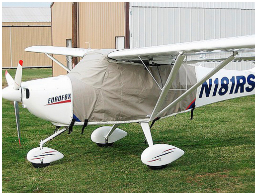
Eurofox LSA Extended Canopy Cover (same as an Aerotrek)

This cover type is made from Silver Acrylic Sunbrella canvas and is 100% lined with a soft and smooth microfiber. Bruce's Custom Covers developed this material combination especially for aircraft protection. The outer material is medium weight and treated for water resistance, UV resistance and anti-static buildup. The inner lining is a very soft and smooth microfiber to prevent scratching. The material is very reflective, and tests show that the cabin interior temperature can be reduced to near-ambient temperature on the hottest of days. It is water, ice and snow repellent, yet breathable to allow moisture to escape from between the cover and the aircraft surface.