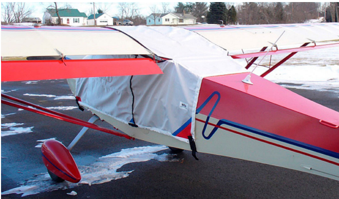
Kitfox IV Over-the-top Canopy Cover

This cover type is made from Silver Acrylic Sunbrella canvas and is 100% lined with a soft and smooth microfiber. Bruce's Custom Covers developed this material combination especially for aircraft protection. The outer material is medium weight and treated for water resistance, UV resistance and anti-static buildup. The inner lining is a very soft and smooth microfiber to prevent scratching. The material is very reflective, and tests show that the cabin interior temperature can be reduced to near-ambient temperature on the hottest of days. It is water, ice and snow repellent, yet breathable to allow moisture to escape from between the cover and the aircraft surface.