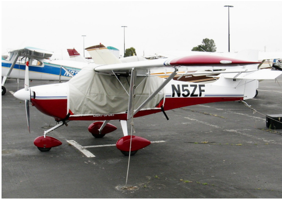
Eurofox Canopy Cover