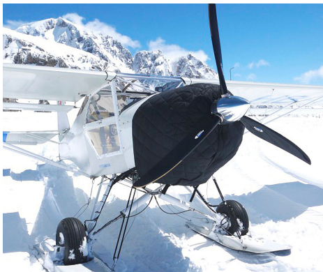
Kitfox Insulated Engine Cover

This cover type is made from Silver Acrylic Sunbrella canvas and is 100% lined with a soft and smooth microfiber. Bruce's Custom Covers developed this material combination especially for aircraft protection. The outer material is medium weight and treated for water resistance, UV resistance and anti-static buildup. The inner lining is a very soft and smooth microfiber to prevent scratching. The material is very reflective, and tests show that the cabin interior temperature can be reduced to near-ambient temperature on the hottest of days. It is water, ice and snow repellent, yet breathable to allow moisture to escape from between the cover and the aircraft surface.