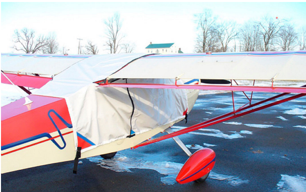
Kitfox IV Over-the-top Canopy Cover

This cover type is made from Silver Acrylic Sunbrella canvas and is 100% lined with a soft and smooth microfiber. Bruce's Custom Covers developed this material combination especially for aircraft protection. The outer material is medium weight and treated for water resistance, UV resistance and anti-static buildup. The inner lining is a very soft and smooth microfiber to prevent scratching. The material is very reflective, and tests show that the cabin interior temperature can be reduced to near-ambient temperature on the hottest of days. It is water, ice and snow repellent, yet breathable to allow moisture to escape from between the cover and the aircraft surface.