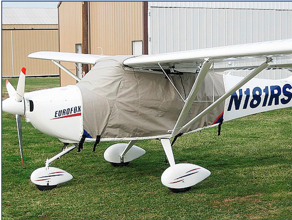
Eurofox LSA Extended Canopy Cover (same as an Aerotrek)