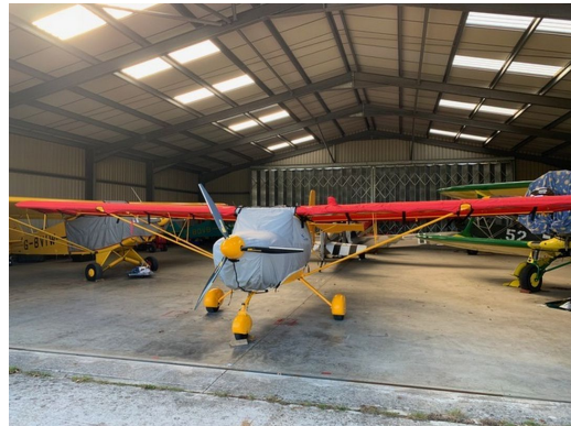
Eurofox Canopy/Engine Cover, light weight travel type