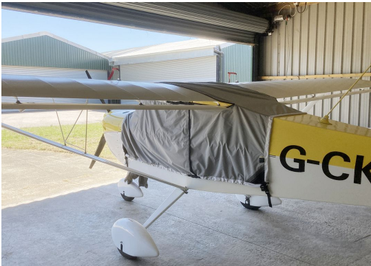
Eurofox Travel Canopy Cover

Travel Covers are made with Silver Solution-Dyed Polyester fabric and only lined over the windshield to save weight. The material is lightweight and more compact for easy stowage in the aircraft. The polyester material is water resistant, but only intended for occasional use outside. We also have an ultra lightweight material available for fitted hangar dust covers. For daily outdoor use, the non-travel Sunbrella Cover is the best choice.