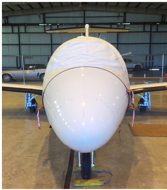
Eclipse Cockpit Door Cover, with Pitot Tube Covers

This cover type is made from Silver Acrylic Sunbrella canvas and is 100% lined with a soft and smooth microfiber. Bruce's Custom Covers developed this material combination especially for aircraft protection. The outer material is medium weight and treated for water resistance, UV resistance and anti-static buildup. The inner lining is a very soft and smooth microfiber to prevent scratching. The material is very reflective, and tests show that the cabin interior temperature can be reduced to near-ambient temperature on the hottest of days. It is water, ice and snow repellent, yet breathable to allow moisture to escape from between the cover and the aircraft surface.