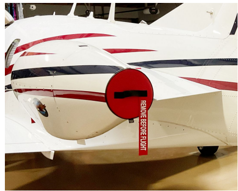
Eclipse EA500 Intake/Exhaust Plugs