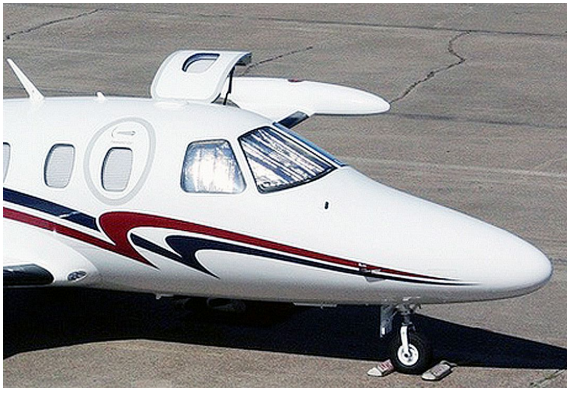
Eclipse Cockpit Heatshields