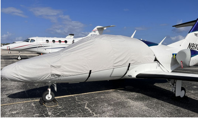
Eclipse EA500 Canopy/Nose Cover

The Eclipse EA500, TE500, 550 Bikini Style Engine Covers are a single-piece design using a soft and smooth stretchy fabric. The cover stretches tightly over both the intake and exhaust, installing quickly and easily. These covers are designed to be used as hangar dust covers and have a useful life of approximately one year.