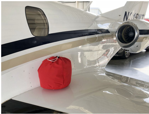
Eclipse EA500, TE500, 550 Travel Cover, Canopy/Nose Cover in Storage bag

This cover type is made from Silver Acrylic Sunbrella canvas and is 100% lined with a soft and smooth microfiber. Bruce's Custom Covers developed this material combination especially for aircraft protection. The outer material is medium weight and treated for water resistance, UV resistance and anti-static buildup. The inner lining is a very soft and smooth microfiber to prevent scratching. The material is very reflective, and tests show that the cabin interior temperature can be reduced to near-ambient temperature on the hottest of days. It is water, ice and snow repellent, yet breathable to allow moisture to escape from between the cover and the aircraft surface.