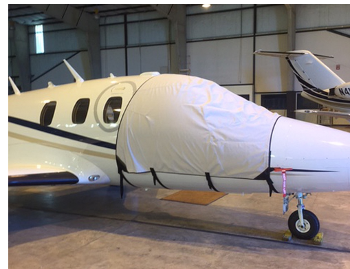
Eclipse Cockpit Door Cover, with Pitot Tube Covers