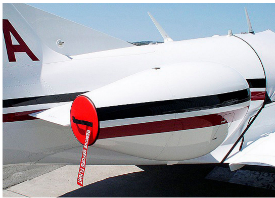
Eclipse Engine Exhaust Plugs set