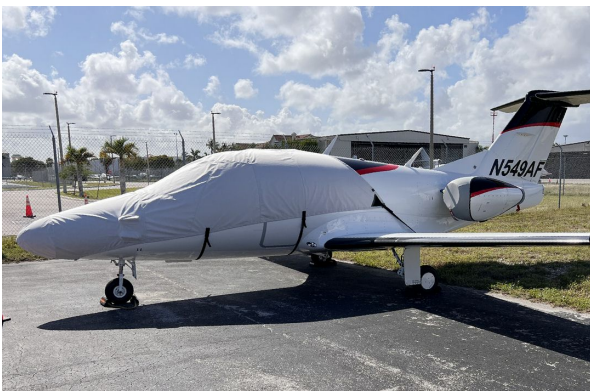
Eclipse EA500 Canopy/Nose Cover

This cover type is made from Silver Acrylic Sunbrella canvas and is 100% lined with a soft and smooth microfiber. Bruce's Custom Covers developed this material combination especially for aircraft protection. The outer material is medium weight and treated for water resistance, UV resistance and anti-static buildup. The inner lining is a very soft and smooth microfiber to prevent scratching. The material is very reflective, and tests show that the cabin interior temperature can be reduced to near-ambient temperature on the hottest of days. It is water, ice and snow repellent, yet breathable to allow moisture to escape from between the cover and the aircraft surface.