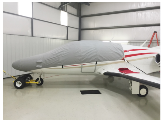
Eclipse Travel Weight Canopy/Nose Cover