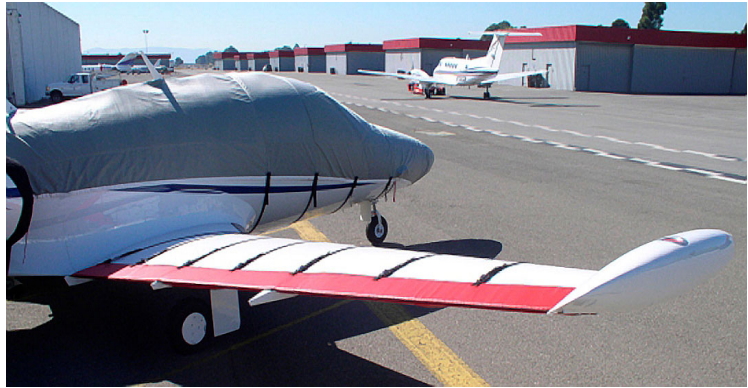
Fuselage Cover with Hail Protection & Wing Control Surfaces Hail Protection Pads