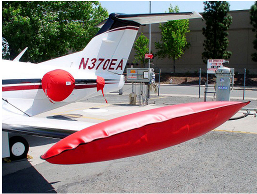
Eclipse Tip Tank & Engine Covers

Designed to prevent damage to the aircraft extremities in crowded hangars, these products are made of bright red Naugahyde and thickly padded with a sandwich of closed cell foam.