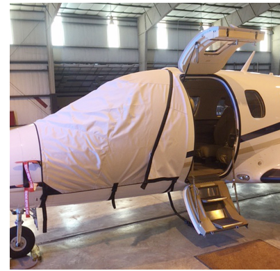
Eclipse Cockpit Door Cover, with Pitot Tube Covers