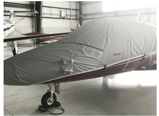
Eclipse EA550 Travel Canopy/Nose Cover