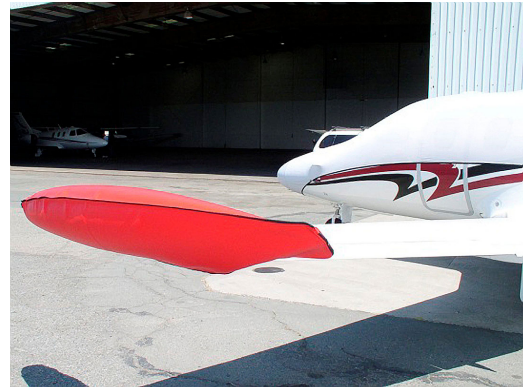
Eclipse Tip Tank Cover