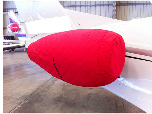
Eclipse Insulated Engine Cover