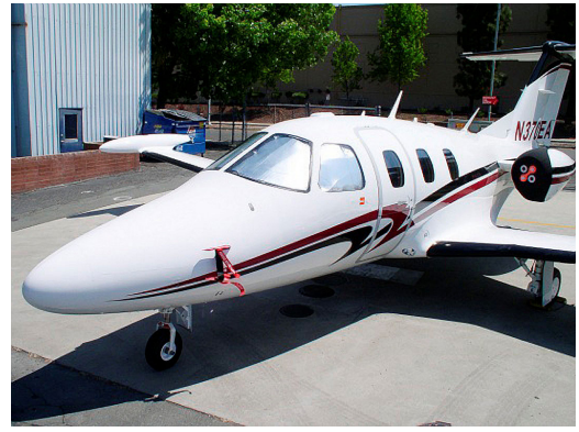
Eclipse Pitot Cover & Bikini Type Engine Covers