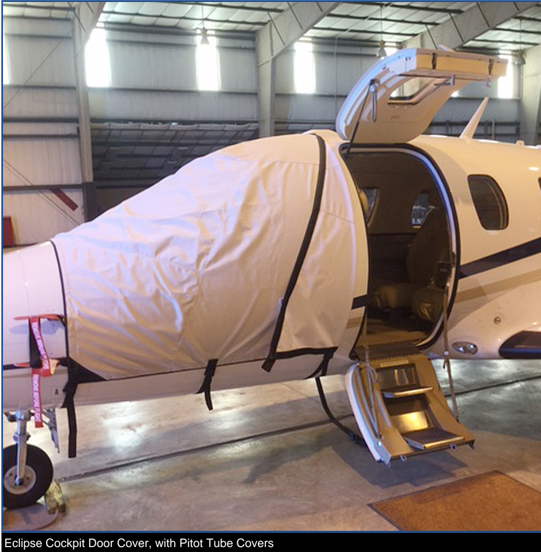
Eclipse Cockpit Door Cover, with Pitot Tube Covers