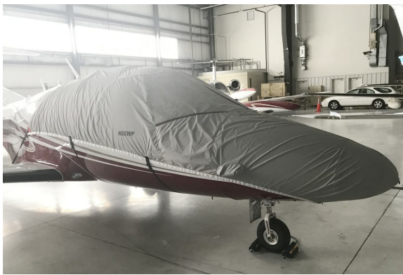
Eclipse EA550 Travel Canopy/Nose Cover

This cover type is made from Silver Acrylic Sunbrella canvas and is 100% lined with a soft and smooth microfiber. Bruce's Custom Covers developed this material combination especially for aircraft protection. The outer material is medium weight and treated for water resistance, UV resistance and anti-static buildup. The inner lining is a very soft and smooth microfiber to prevent scratching. The material is very reflective, and tests show that the cabin interior temperature can be reduced to near-ambient temperature on the hottest of days. It is water, ice and snow repellent, yet breathable to allow moisture to escape from between the cover and the aircraft surface.