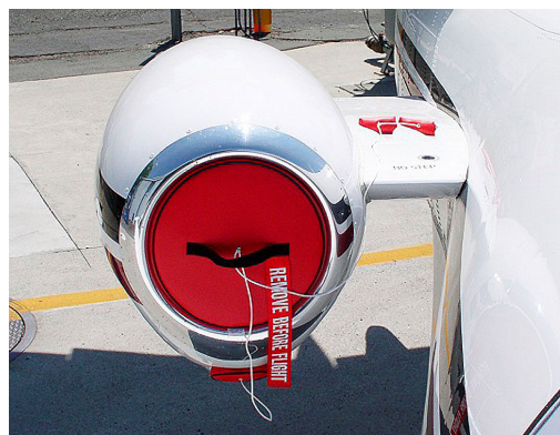
Engine Inlet Plugs set (set of 10, 5 per side)