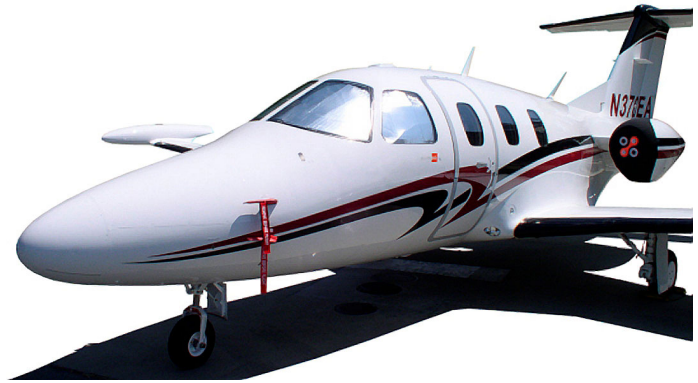
Cockpit HeatShields, Pitot Covers & "Bikini" style Engine Covers