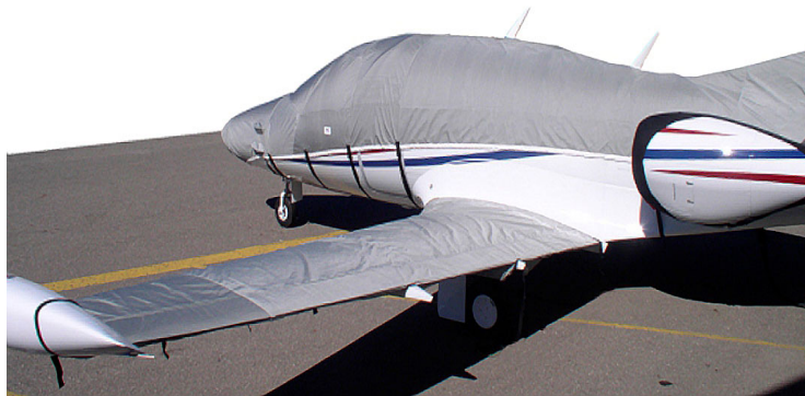
Fuselage Cover & Wing Covers with hail protection on all upper surfaces

WINTER USE MATERIAL - Made with Solution-Dyed Polyester fabric, this option is intended for seasonal use to aid in deicing, rain mitigation, or for occasional travel. The material is lighter and more compact, but more susceptible to UV damage and may have a shorter useful life if used continuously outside than the all-year use material.