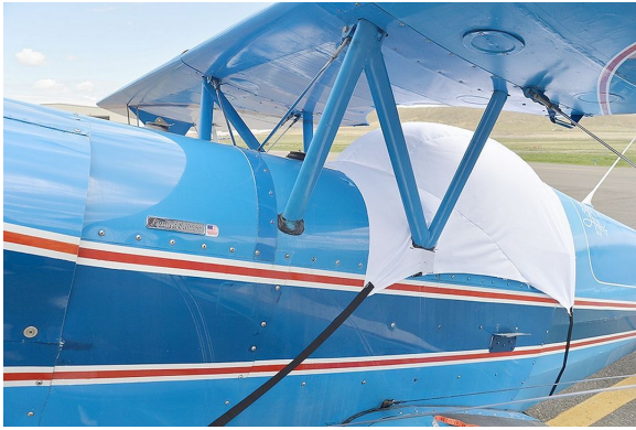
Acro Sport Canopy Cover

the hottest of days. It is water, ice and snow repellent, yet breathable to allow moisture to escape from between the cover and the aircraft surface.