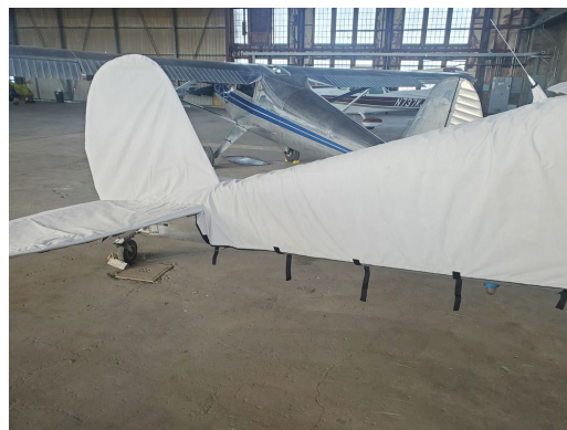
Cessna 140 Empennage Cover