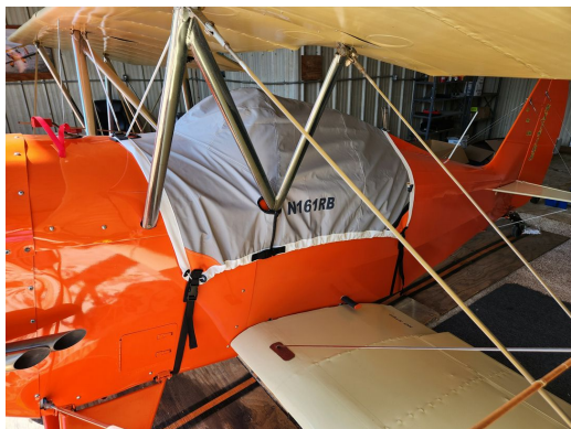
Burt Special Canopy Cover

This cover type is made from Silver Acrylic Sunbrella canvas and is 100% lined with a soft and smooth microfiber. Bruce's Custom Covers developed this material combination especially for aircraft protection. The outer material is medium weight and treated for water resistance, UV resistance and anti-static buildup. The inner lining is a very soft and smooth microfiber to prevent scratching. The material is very reflective, and tests show that the cabin interior temperature can be reduced to near-ambient temperature on the hottest of days. It is water, ice and snow repellent, yet breathable to allow moisture to escape from between the cover and the aircraft surface.