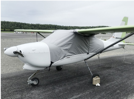
Glasair Aviation Glastar, Sportsman 2+2 Travel Cover, Light Weight Travel Canopy Cover