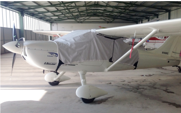
OMF Symphony Canopy, Wings, Horiz. Stab, and Prop Covers