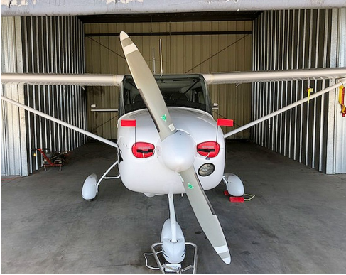
2006 OMF Symphony SA160

plugs have warning flags that are visible from the cockpit or 'remove before flight' streamers sewn onto the face of the plugs. Most plugs are imprinted with the aircraft registration number in black for an extra charge. Storage bag NOT included. Engine plugs may be inserted after flight when the engine is still warm. Engine Inlet Plugs are commonly referred to as Cowl Plugs, Intake Plugs, Cowl Blocks, Engine Blocks, and Engine Bungs.