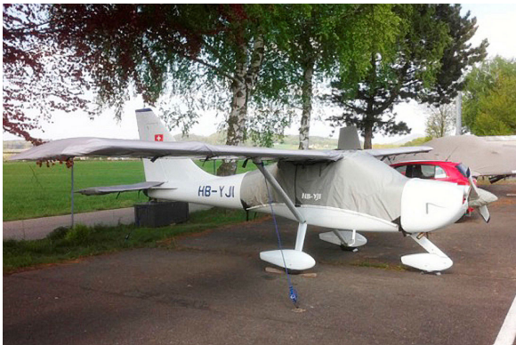
OMF Symphony Canopy, Wings, Horiz. Stab, and Prop Covers

This cover type is made from Silver Acrylic Sunbrella canvas and is 100% lined with a soft and smooth microfiber. Bruce's Custom Covers developed this material combination especially for aircraft protection. The outer material is medium weight and treated for water resistance, UV resistance and anti-static buildup. The inner lining is a very soft and smooth microfiber to prevent scratching. The material is very reflective, and tests show that the cabin interior temperature can be reduced to near-ambient temperature on the hottest of days. It is water, ice and snow repellent, yet breathable to allow moisture to escape from between the cover and the aircraft surface.