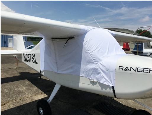
Vashon Ranger VR-7 Canopy Cover, test fit cover

Travel Covers are made with Silver Solution-Dyed Polyester fabric and only lined over the windshield to save weight. The material is lightweight and more compact for easy stowage in the aircraft. The polyester material is water resistant, but only intended for occasional use outside. We also have an ultra lightweight material available for fitted hangar dust covers. For daily outdoor use, the non-travel Sunbrella Cover is the best choice.