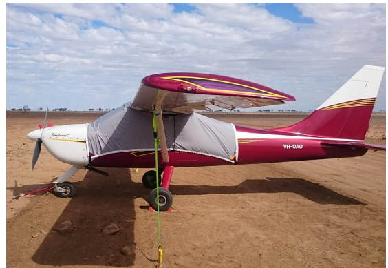
Glastar Sportsman Light Weight Travel Cover