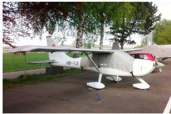
OMF Symphony Canopy, Wings, Horiz. Stab, and Prop Covers