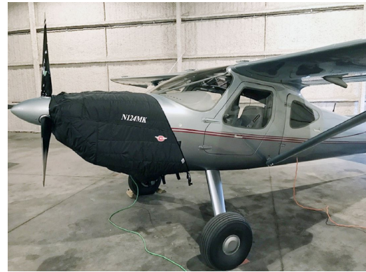
OMF Symphony Canopy, Wings, Horiz. Stab, and Prop Covers Glasair Aviation Glastar, Sportsman 2+2 Insulated Engine Cover