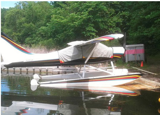
Glastar Sportsman Canopy Cover

Travel Covers are made with Silver Solution-Dyed Polyester fabric and only lined over the windshield to save weight. The material is lightweight and more compact for easy stowage in the aircraft. The polyester material is water resistant, but only intended for occasional use outside. We also have an ultra lightweight material available for fitted hangar dust covers. For daily outdoor use, the non-travel Sunbrella Cover is the best choice.