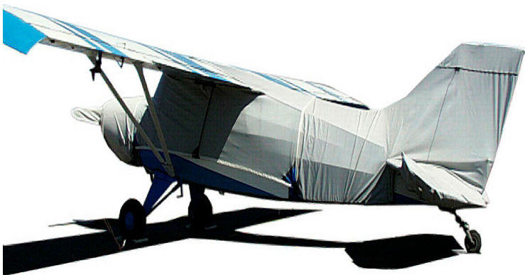
Maule Empennage, Engine & Prop Covers

WINTER USE MATERIAL - Made with Solution-Dyed Polyester fabric, this option is intended for seasonal use to aid in deicing, rain mitigation, or for occasional travel. The material is lighter and more compact, but more susceptible to UV damage and may have a shorter useful life if used continuously outside than the all-year use material.