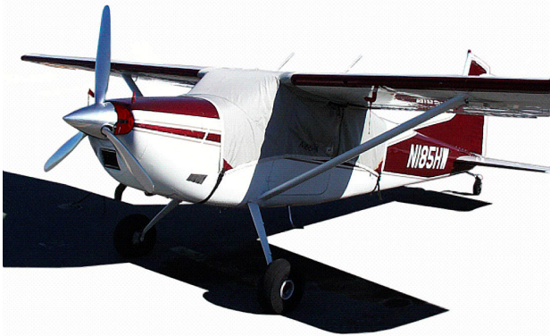
Cessna 185 Over-the-Top Canopy Cover