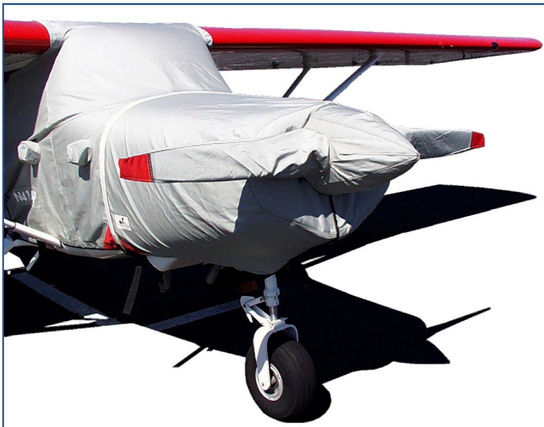
Maule Prop (2 Blade), Engine, &amp; Canopy Cover