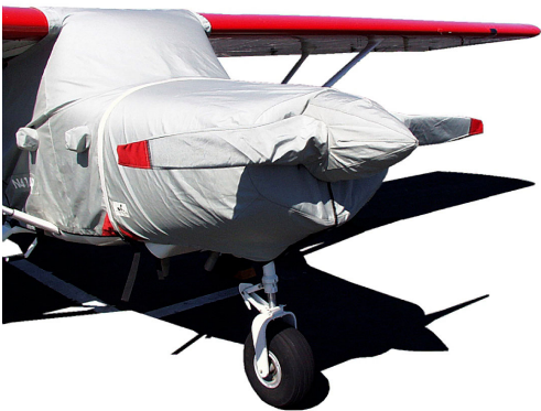
Maule Prop (2 Blade), Engine, & Canopy Cover

This cover type is made from Silver Acrylic Sunbrella canvas and is 100% lined with a soft and smooth microfiber. Bruce's Custom Covers developed this material combination especially for aircraft protection. The outer material is medium weight and treated for water resistance, UV resistance and anti-static buildup. The inner lining is a very soft and smooth microfiber to prevent scratching. The material is very reflective, and tests show that the cabin interior temperature can be reduced to near-ambient temperature on the hottest of days. It is water, ice and snow repellent, yet breathable to allow moisture to escape from between the cover and the aircraft surface.