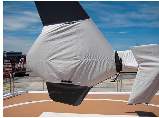
EC-135 Tailfan Cover and Tailboom Stabilizer Cover