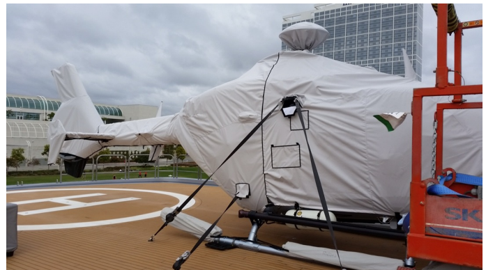
EC-135 Full Cover Set