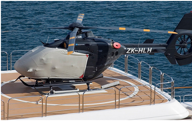
EC-135 Bubble Cover & Exhaust Plugs