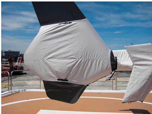
EC-135 Tailfan Cover and Tailboom Stabilizer Cover

The Tailboom Cover details vary by model, but generally the helicopter tail boom cover encloses the tail boom from the "bottleneck" to the aft end. They usually also cover the horizontal stabilizers, and are custom made to allow for antennae, lights, and other protrusions. They attach with straps underneath the tail boom. Covers for the vertical and horizontal stabilizers are also available separately. Specific information for each model is available on request.