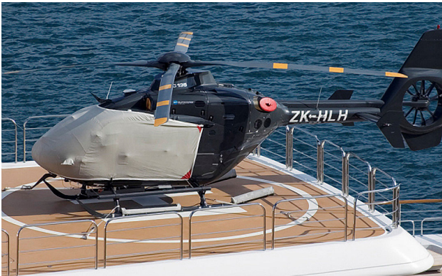
EC-135 Bubble Cover & Exhaust Plugs