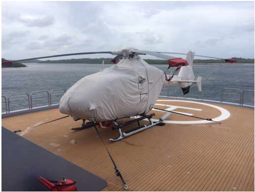
Eurocopter EC-135 Full Body Covers

The Eurocopter EC-135 Intake Cover . Details vary by model, but generally helicopter intake covers are designed to enclose the intake are only. They are smaller than helicopter engine covers, and their attachment details can vary from straps, to snaps, or some combination of the two. Specific information for each model is available on request.