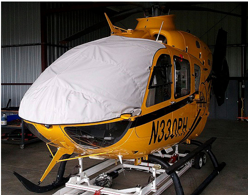
EC-135 Windshield/Skylights Cover, pinches in door jambs

This cover type is made from Silver Acrylic Sunbrella canvas and is 100% lined with a soft and smooth microfiber. Bruce's Custom Covers developed this material combination especially for aircraft protection. The outer material is medium weight and treated for water resistance, UV resistance and anti-static buildup. The inner lining is a very soft and smooth microfiber to prevent scratching. The material is very reflective, and tests show that the cabin interior temperature can be reduced to near-ambient temperature on the hottest of days. It is water, ice and snow repellent, yet breathable to allow moisture to escape from between the cover and the aircraft surface.