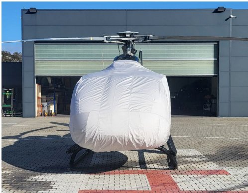
Airbus Helicopter H-130 Bubble Cover, Extends To Cover Fwd Engine Inlet

This cover type is made from Silver Acrylic Sunbrella canvas and is 100% lined with a soft and smooth microfiber. Bruce's Custom Covers developed this material combination especially for aircraft protection. The outer material is medium weight and treated for water resistance, UV resistance and anti-static buildup. The inner lining is a very soft and smooth microfiber to prevent scratching. The material is very reflective, and tests show that the cabin interior temperature can be reduced to near-ambient temperature on the hottest of days. It is water, ice and snow repellent, yet breathable to allow moisture to escape from between the cover and the aircraft surface.