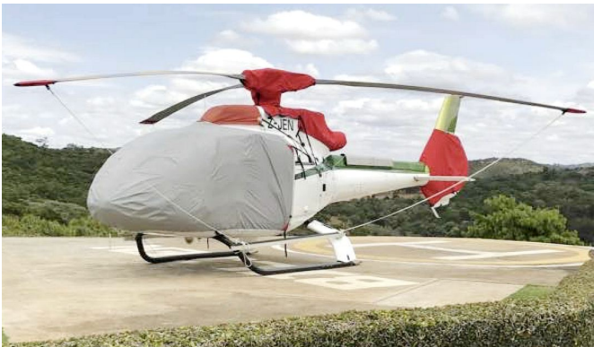
EC130 Bubble, Intake, Exhaust, Rotor Hub & Tailfan Covers

This cover type is made from Silver Acrylic Sunbrella canvas and is 100% lined with a soft and smooth microfiber. Bruce's Custom Covers developed this material combination especially for aircraft protection. The outer material is medium weight and treated for water resistance, UV resistance and anti-static buildup. The inner lining is a very soft and smooth microfiber to prevent scratching. The material is very reflective, and tests show that the cabin interior temperature can be reduced to near-ambient temperature on the hottest of days. It is water, ice and snow repellent, yet breathable to allow moisture to escape from between the cover and the aircraft surface.