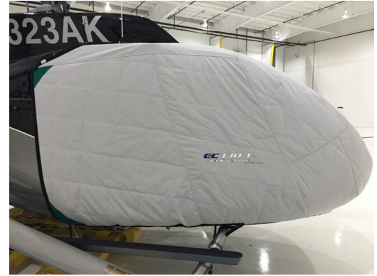
EC-130 Insulated Bubble Cover