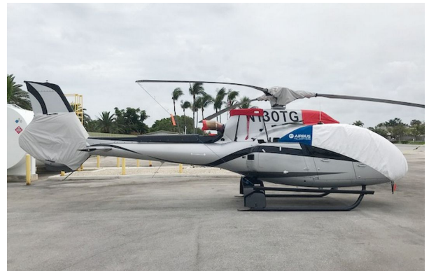
AIRBUS H130 T2, Intake, Exhaust & Tailfan Covers