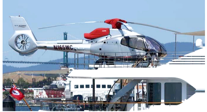
Intake/Exhaust Cover & Rotor Hub Cover (w/ skirt)