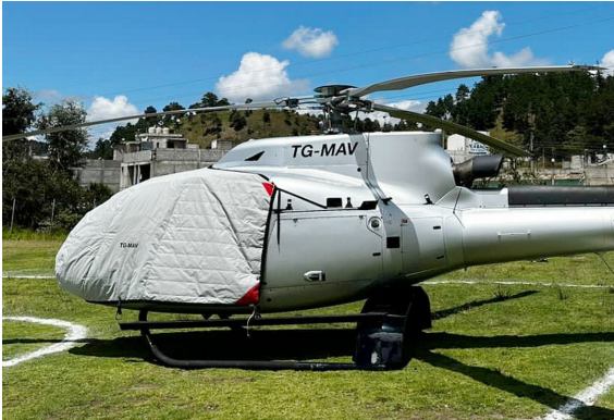
Airbus H-130 Insulated Bubble Cover

This cover type is made from Silver Acrylic Sunbrella canvas and is 100% lined with a soft and smooth microfiber. Bruce's Custom Covers developed this material combination especially for aircraft protection. The outer material is medium weight and treated for water resistance, UV resistance and anti-static buildup. The inner lining is a very soft and smooth microfiber to prevent scratching. The material is very reflective, and tests show that the cabin interior temperature can be reduced to near-ambient temperature on the hottest of days. It is water, ice and snow repellent, yet breathable to allow moisture to escape from between the cover and the aircraft surface.