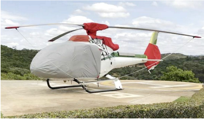
EC130 Bubble, Intake, Exhaust, Rotor Hub & Tailfan Covers

This cover type is made from Silver Acrylic Sunbrella canvas and is 100% lined with a soft and smooth microfiber. Bruce's Custom Covers developed this material combination especially for aircraft protection. The outer material is medium weight and treated for water resistance, UV resistance and anti-static buildup. The inner lining is a very soft and smooth microfiber to prevent scratching. The material is very reflective, and tests show that the cabin interior temperature can be reduced to near-ambient temperature on the hottest of days. It is water, ice and snow repellent, yet breathable to allow moisture to escape from between the cover and the aircraft surface.