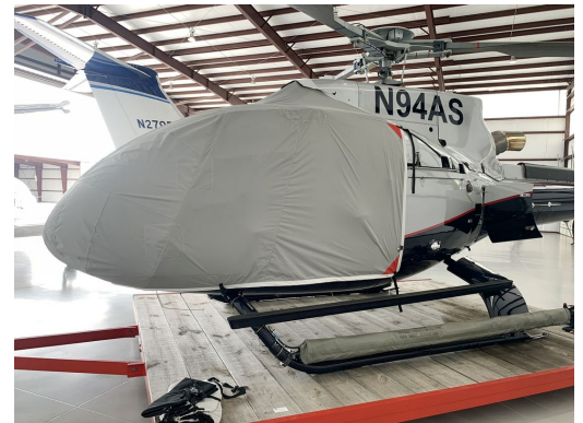
Airbus H-130 Bubble Cover, Travel Weight