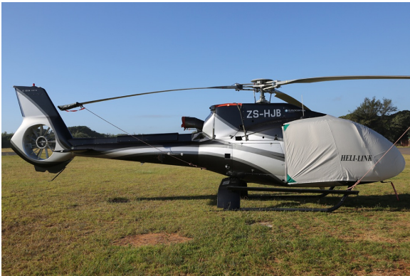
EC-130 Bubble Cover