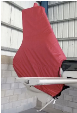
Eurocopter EC-130 Tailfan/Upper Vert Stab Housing Cover

The Tailboom Cover details vary by model, but generally the helicopter tail boom cover encloses the tail boom from the "bottleneck" to the aft end. They usually also cover the horizontal stabilizers, and are custom made to allow for antennae, lights, and other protrusions. They attach with straps underneath the tail boom. Covers for the vertical and horizontal stabilizers are also available separately. Specific information for each model is available on request.