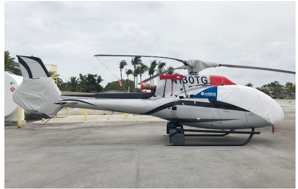
AIRBUS H130 T2, Intake, Exhaust & Tailfan Covers