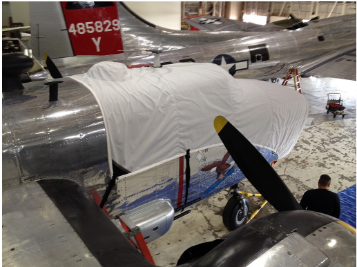
B25 Cockpit/Nose Cover