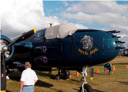
Mitchell B25 Cockpit Cover w/ Custom Imprint (Bellystrap Type)

This cover type is made from Silver Acrylic Sunbrella canvas and is 100% lined with a soft and smooth microfiber. Bruce's Custom Covers developed this material combination especially for aircraft protection. The outer material is medium weight and treated for water resistance, UV resistance and anti-static buildup. The inner lining is a very soft and smooth microfiber to prevent scratching. The material is very reflective, and tests show that the cabin interior temperature can be reduced to near-ambient temperature on the hottest of days. It is water, ice and snow repellent, yet breathable to allow moisture to escape from between the cover and the aircraft surface.