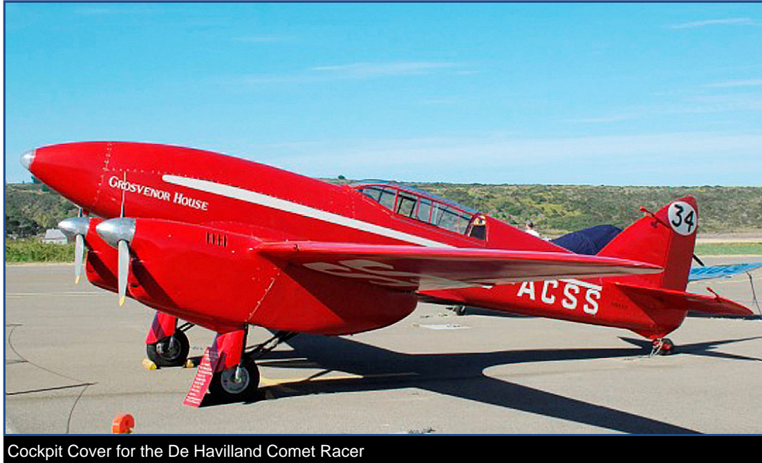
Cockpit Cover for the De Havilland Comet Racer