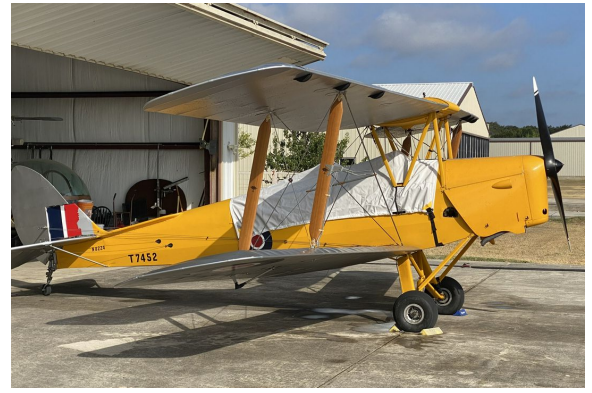
Dehavilland DH-82 Tiger Moth Canopy Cover