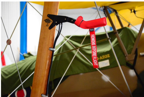
DeHavilland DH-82 Tiger Moth Pitot Cover

DeHavilland DH-82 Tiger Moth Pitot Tube Covers , NOT HEAT RESISTANT TYPE, are made of Naugahyde vinyl, and are designed to cover the entire pitot assembly. Slipping over the tube, the cover tightens around the base with a Velcro strap detail. A "Remove Before Flight" streamer is attached to the cover. Heat Resistant Pitot Covers are an upgrade to this design, and help prevent the pitot cover from melting onto the tube if the pitot heat is accidentally turned on while installed. If you want the set tethered together, please let us know.