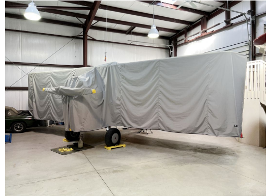
Stearman PT-13 Full Body Dust Cover, Prop Cover Included