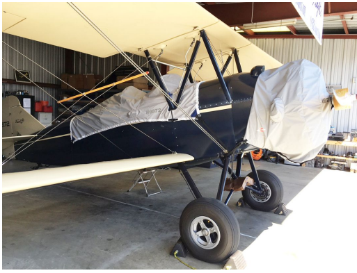
Travel Air 4000 Canopy and Engine Covers, light weight travel type