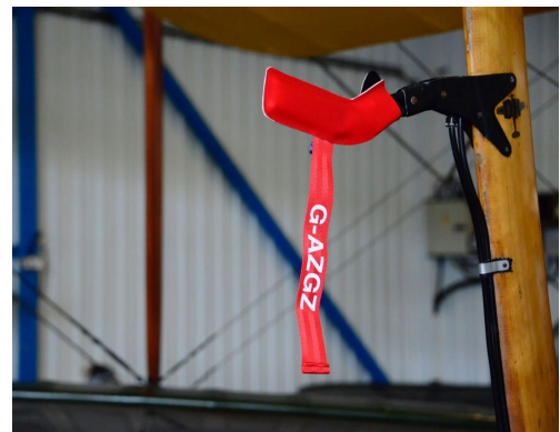
DeHavilland DH-82 Tiger Moth Pitot Cover