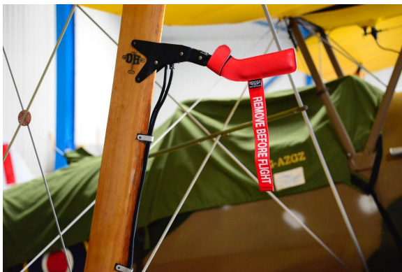
DeHavilland DH-82 Tiger Moth Pitot Cover

DeHavilland DH-82 Tiger Moth Pitot Tube Covers , NOT HEAT RESISTANT TYPE, are made of Naugahyde vinyl, and are designed to cover the entire pitot assembly. Slipping over the tube, the cover tightens around the base with a Velcro strap detail. A "Remove Before Flight" streamer is attached to the cover. Heat Resistant Pitot Covers are an upgrade to this design, and help prevent the pitot cover from melting onto the tube if the pitot heat is accidentally turned on while installed. If you want the set tethered together, please let us know.