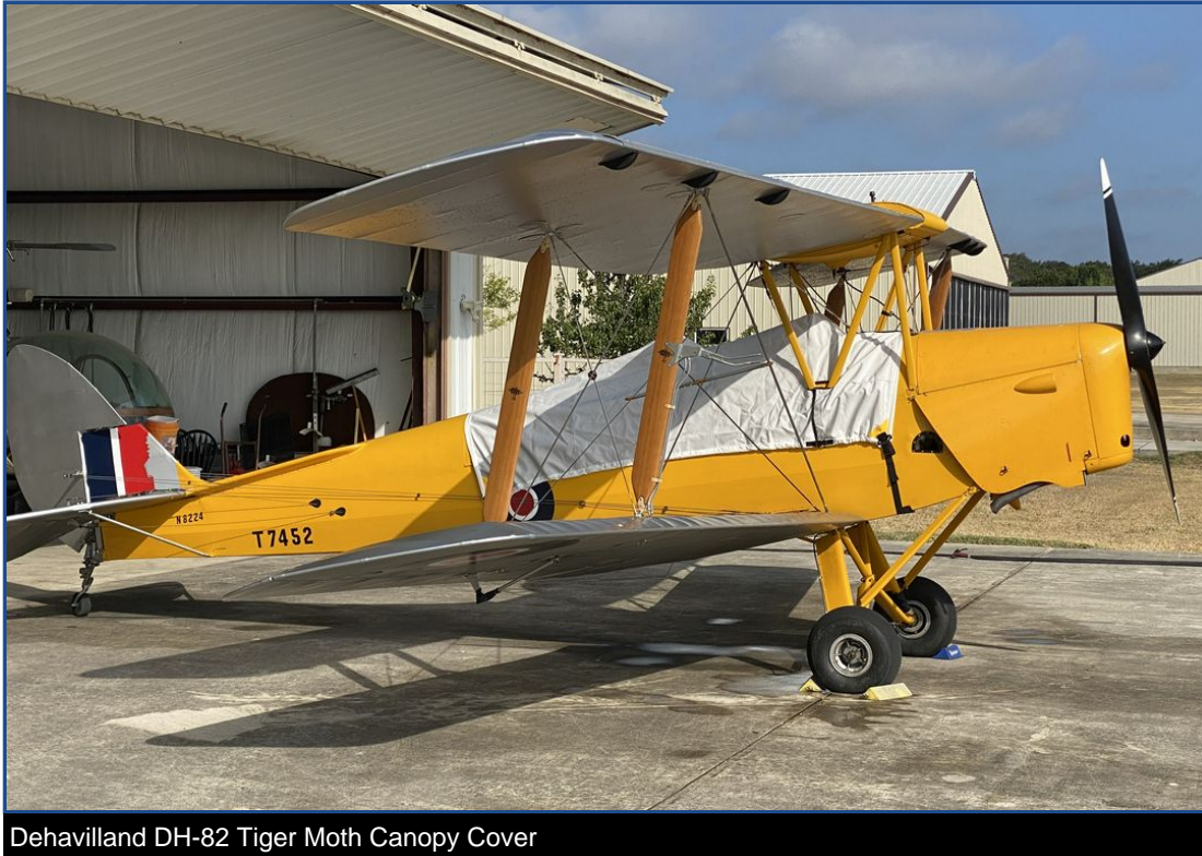
Dehavilland DH-82 Tiger Moth Canopy Cover