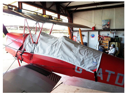
Canopy Cover for the De Havilland Tiger Moth