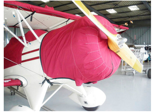
Waco UPF-7 Engine Cover