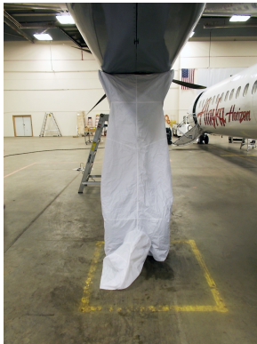
Q400, Main gear landing/tire covers - Cold Weather Ops

The DeHavilland Dash 8 Series 100, 200, 300 Tailcone Cover fits onto the tailcone area to cover the holes that birds can fly into and nest. The cover easily straps onto the leading edge of the horizontal stabilizer with padded hooks or overlaps with the elevators slightly and attaches under the horizontal stabilizers with adjustable straps. Tailcone Covers are normally made with Solution-Dyed Polyester or Acrylic Sunbrella .