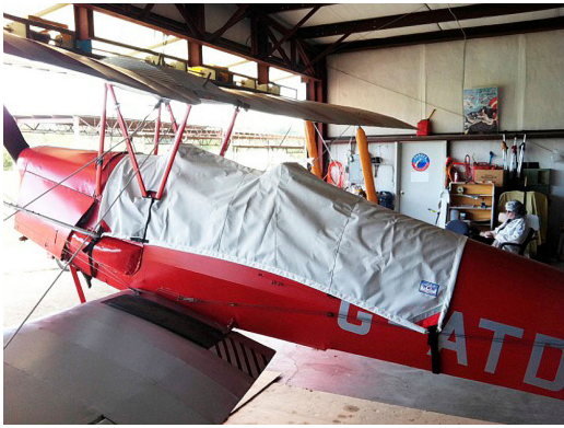
Canopy Cover for the De Havilland Tiger Moth