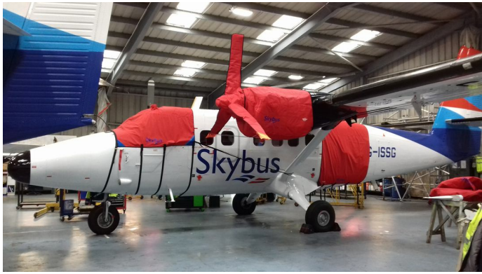
DeHavilland Twin Otter DHC6 (UV-18A) Cockpit Cover (CUSTOM COLOR)