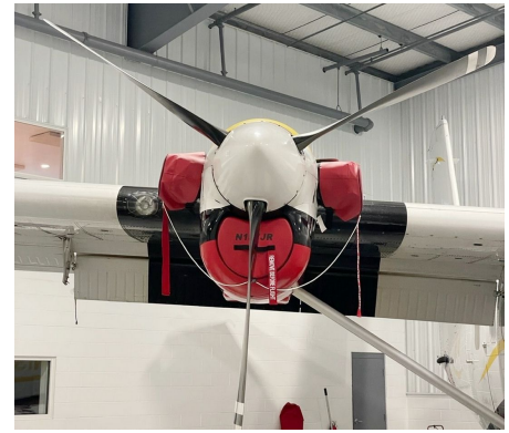
DeHavilland Twin Otter DHC6 (UV-18A) Cockpit Cover (CUSTOM COLOR)