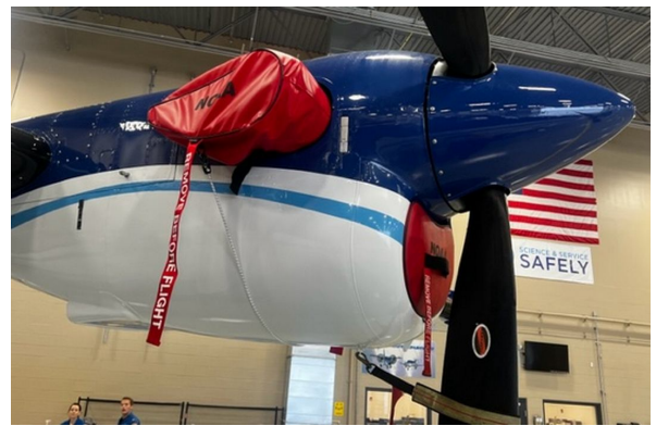
DeHavilland Twin Otter DHC6 Intake Plug, Exhaust Covers