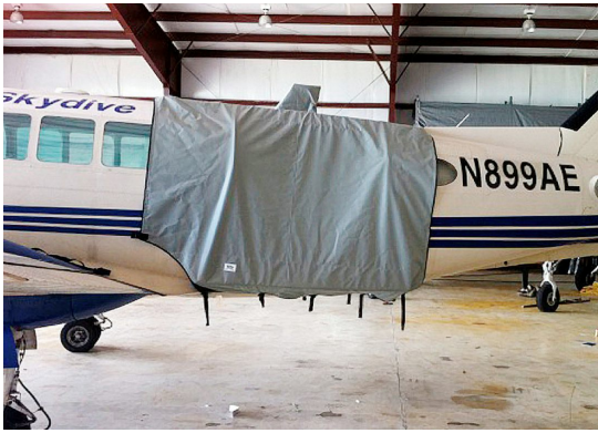
750XL Jump Door Cover