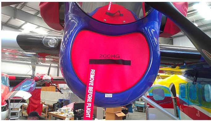
De Havilland Twin Otter Engine Inlet Plug and Exhaust Covers