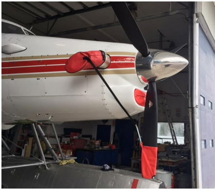
DeHavilland Turbin Otter Intake plugs, Prop Tie/Exhaust Covers