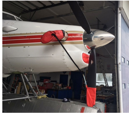
DeHavilland Turbin Otter Intake plugs, Prop Tie/Exhaust Covers