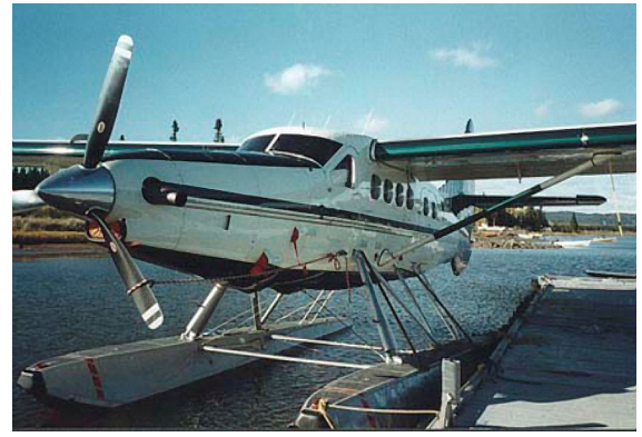
Covers & Plugs for the Turbine Otter