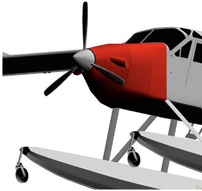
Turbo Beaver Insulated Engine Cover, 3D model

The material is very reflective, and tests show that the cabin interior temperature can be reduced to near-ambient temperature on the hottest of days. It is water, ice and snow repellent, yet breathable to allow moisture to escape from between the cover and the aircraft surface.