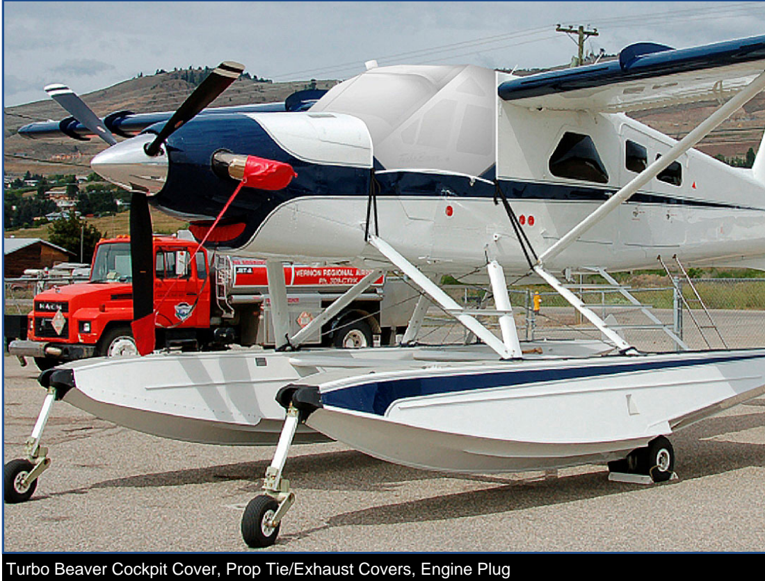
Turbo Beaver Cockpit Cover, Prop Tie/Exhaust Covers, Engine Plug