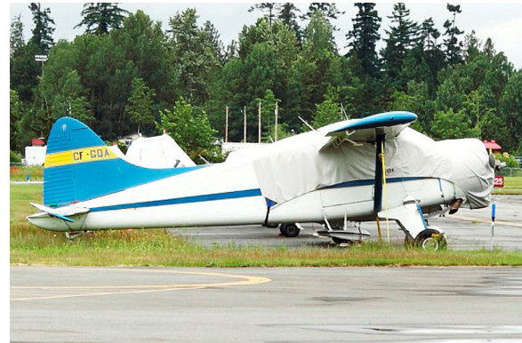
Beaver Canopy/Engine Cover