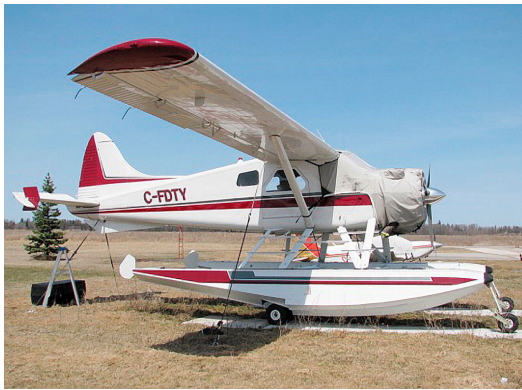
Beaver Windshield/Engine Cover

This cover type is made from Silver Acrylic Sunbrella canvas and is 100% lined with a soft and smooth microfiber. Bruce's Custom Covers developed this material combination especially for aircraft protection. The outer material is medium weight and treated for water resistance, UV resistance and anti-static buildup. The inner lining is a very soft and smooth microfiber to prevent scratching. The material is very reflective, and tests show that the cabin interior temperature can be reduced to near-ambient temperature on the hottest of days. It is water, ice and snow repellent, yet breathable to allow moisture to escape from between the cover and the aircraft surface.