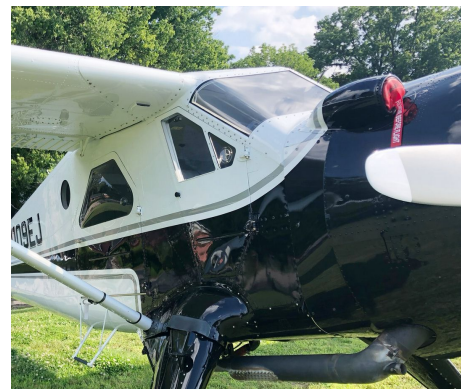
DeHavilland DH-2 Upper Cowling Air Scoop Plug