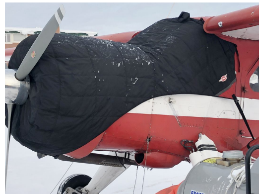
Turbo Beaver Cockpit Cover, Prop Tie/Exhaust Covers, Engine Plug