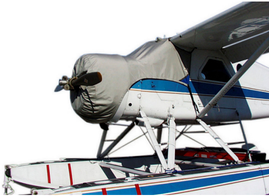
Beaver Windshield/Engine Cover

Travel Covers are made with Silver Solution-Dyed Polyester fabric and only lined over the windshield to save weight. The material is lightweight and more compact for easy stowage in the aircraft. The polyester material is water resistant, but only intended for occasional use outside. We also have an ultra lightweight material available for fitted hangar dust covers. For daily outdoor use, the non-travel Sunbrella Cover is the best choice.