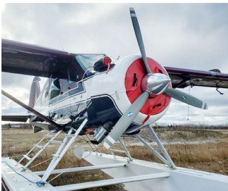
DeHavilland DH2 Beaver Engine Plugs

Engine Inlet Plugs are custom fit for your DeHavilland Beaver DHC-2, U-6A, U-6B intakes, made with heavy-duty vinyl material, and stuffed with a single block of sculpted urethane foam. Each plug has a zipper that allows the foam to be removed and dried if necessary. Engine plugs have warning flags that are visible from the cockpit or 'remove before flight' streamers sewn onto the face of the plugs. Most plugs are imprinted with the aircraft registration number in black for an extra charge. Storage bag NOT included. Engine plugs may be inserted after flight when the engine is still warm. Engine Inlet Plugs are commonly referred to as Cowl Plugs, Intake Plugs, Cowl Blocks, Engine Blocks, and Engine Bungs.