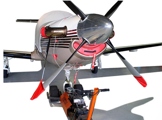
Pilatus PC-12 LARGE ENGINE INLET PLUG, SMALL PLUGS SET, Prop Tie/Exhaust Covers