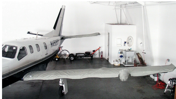
Pilatus PC-12 Wing Covers

WINTER USE MATERIAL - Made with Solution-Dyed Polyester fabric, this option is intended for seasonal use to aid in deicing, rain mitigation, or for occasional travel. The material is lighter and more compact, but more susceptible to UV damage and may have a shorter useful life if used continuously outside than the all-year use material.