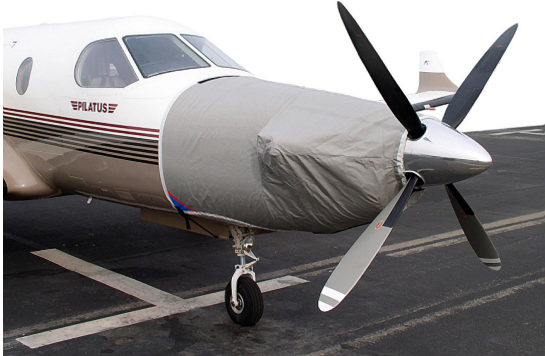
Pilatus PC-12 Engine Cover

This cover type is made from Silver Acrylic Sunbrella canvas and is 100% lined with a soft and smooth microfiber. Bruce's Custom Covers developed this material combination especially for aircraft protection. The outer material is medium weight and treated for water resistance, UV resistance and anti-static buildup. The inner lining is a very soft and smooth microfiber to prevent scratching. The material is very reflective, and tests show that the cabin interior temperature can be reduced to near-ambient temperature on the hottest of days. It is water, ice and snow repellent, yet breathable to allow moisture to escape from between the cover and the aircraft surface.