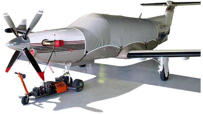
PC-12 Canopy Cover, Engine Plugs, Prop Tie/Exhaust Covers