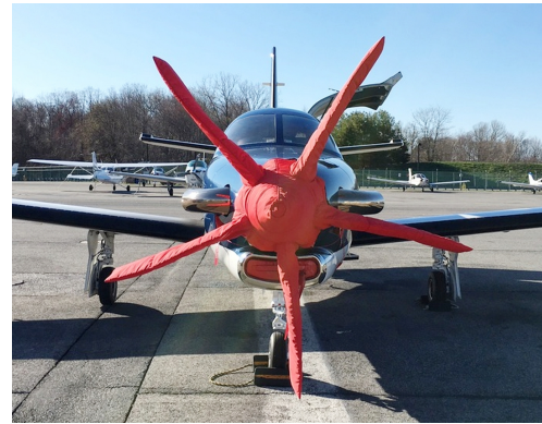
Socata TBM Insulated 5-Blade Prop/Spinner Cover