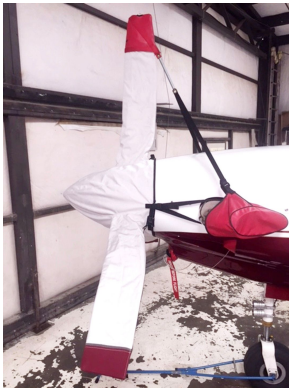
Pilatus PC-12 Prop Cover, Prop Tie/Exhaust Cover

This cover type is made from Silver Acrylic Sunbrella canvas and is 100% lined with a soft and smooth microfiber. Bruce's Custom Covers developed this material combination especially for aircraft protection. The outer material is medium weight and treated for water resistance, UV resistance and anti-static buildup. The inner lining is a very soft and smooth microfiber to prevent scratching. The material is very reflective, and tests show that the cabin interior temperature can be reduced to near-ambient temperature on the hottest of days. It is water, ice and snow repellent, yet breathable to allow moisture to escape from between the cover and the aircraft surface.