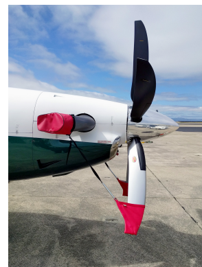
Main Intake Plug and Prop-Tie/Exhaust Covers. (Sold Separately)