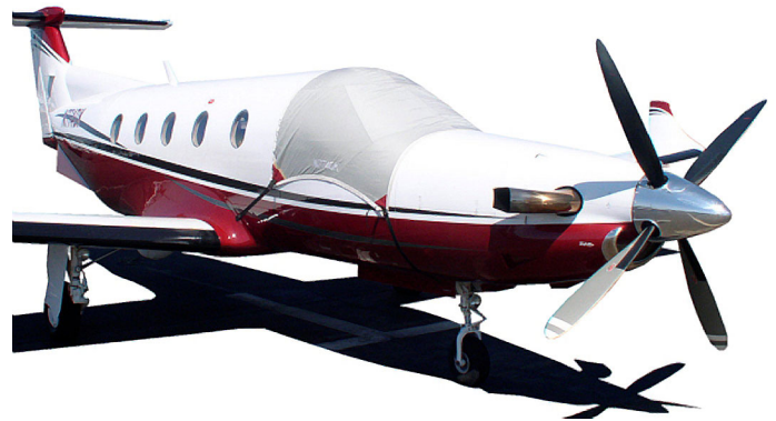
PC-12 Windshield Cover