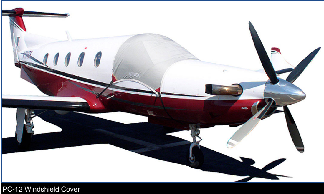
PC-12 Windshield Cover