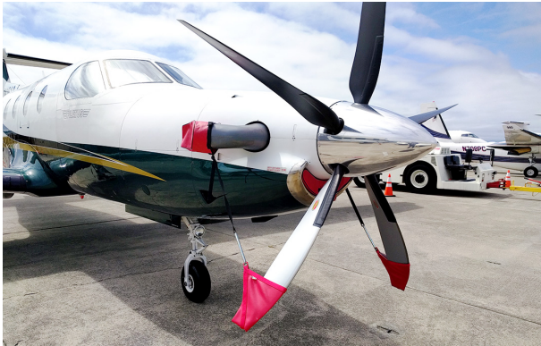
Main Intake Plug and Prop-Tie/Exhaust Covers. (Sold Separately)

Engine Inlet Plugs are custom fit for your Beech Denali 220 intakes, made with heavy-duty vinyl material, and stuffed with a single block of sculpted urethane foam. Each plug has a zipper that allows the foam to be removed and dried if necessary. Engine plugs have warning flags that are visible from the cockpit or 'remove before flight' streamers sewn onto the face of the plugs. Most plugs are imprinted with the aircraft registration number in black for an extra charge. Storage bag NOT included. Engine plugs may be inserted after flight when the engine is still warm. Engine Inlet Plugs are commonly referred to as Cowl Plugs, Intake Plugs, Cowl Blocks, Engine Blocks, and Engine Bungs.