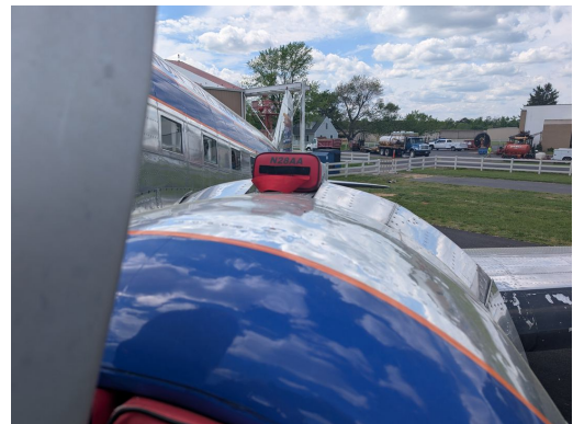
Douglas DC-3 Engine Plugs