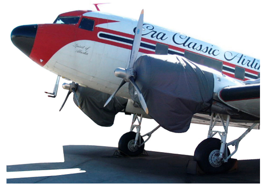
Engine Covers are available in either standard or insulated designs.