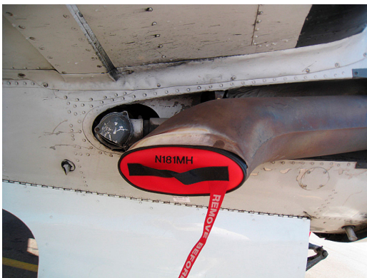
Beech 18 Exhaust Plugs

Engine Inlet Plugs are custom fit for your Douglas DC-3 intakes, made with heavy-duty vinyl material, and stuffed with a single block of sculpted urethane foam. Each plug has a zipper that allows the foam to be removed and dried if necessary. Engine plugs have warning flags that are visible from the cockpit or 'remove before flight' streamers sewn onto the face of the plugs. Most plugs are imprinted with the aircraft registration number in black for an extra charge. Storage bag NOT included. Engine plugs may be inserted after flight when the engine is still warm. Engine Inlet Plugs are commonly referred to as Cowl Plugs, Intake Plugs, Cowl Blocks, Engine Blocks, and Engine Bungs.