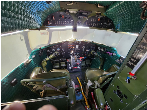
DC-3C Cockpit Heatshields

Cockpit Heatshields are interior sunshades for the aircraft's cockpit. The product is a unique composite of closed-cell foam with a silver mylar finish. The semi-rigid design is stiff enough to stand inside the window framing. The set folds up flat and is easily stored in the included storage sleeve. Some designs may require velcro and suction cups. A Heatshield is an excellent short-term remedy for cockpit overheating, but an external fabric cover is more effective for long-term protection.