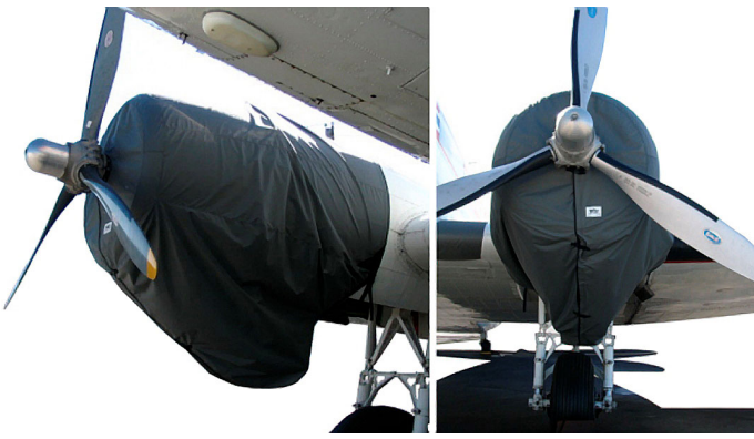
DC3 Engine Covers are custom made for various engine mod's.