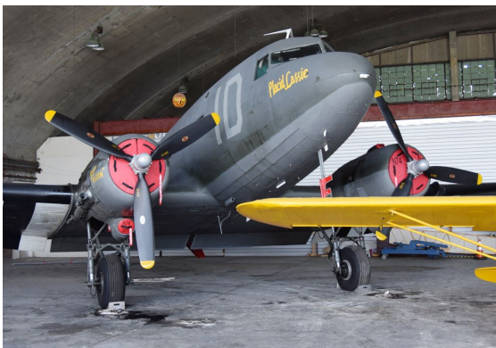
Douglas DC-3 Engine & Oil Cooler Plugs

Engine Inlet Plugs are custom fit for your Douglas DC-3 intakes, made with heavy-duty vinyl material, and stuffed with a single block of sculpted urethane foam. Each plug has a zipper that allows the foam to be removed and dried if necessary. Engine plugs have warning flags that are visible from the cockpit or 'remove before flight' streamers sewn onto the face of the plugs. Most plugs are imprinted with the aircraft registration number in black for an extra charge. Storage bag NOT included. Engine plugs may be inserted after flight when the engine is still warm. Engine Inlet Plugs are commonly referred to as Cowl Plugs, Intake Plugs, Cowl Blocks, Engine Blocks, and Engine Bungs.