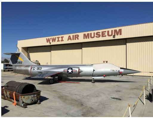
Lockheed F-104 Starfighter Canopy Cover, Single Seat Model