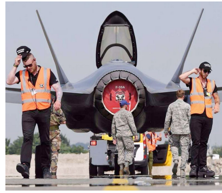
Lockheed Martin F-35 Exhaust Plug, non-folding type