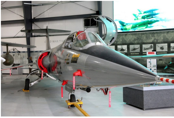
Lockheed F-104 Starfighter Intake Plugs