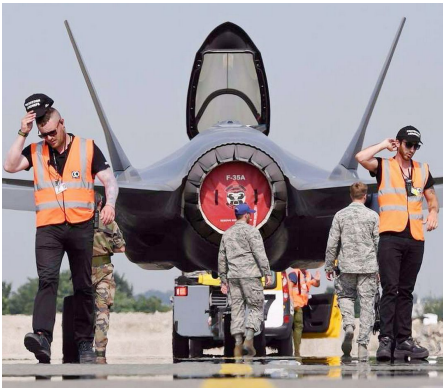
Lockheed Martin F-35 Exhaust Plug, non-folding type