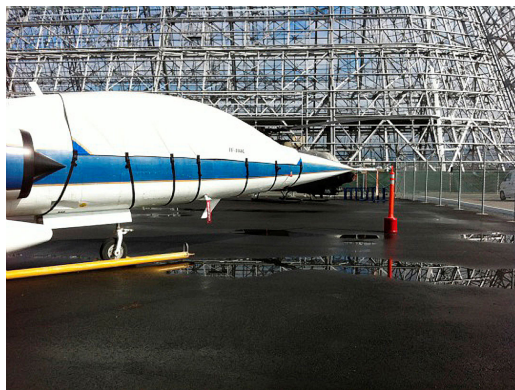
F-104 Tandem Canopy Cover