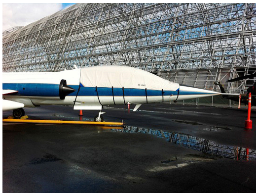
F-104 Tandem Canopy Cover