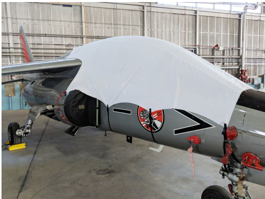
Dornier Alpha Jet Canopy Cover, test fit cover