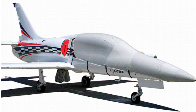
L39 Canopy/Nose Cover & Intake Plugs

Travel Covers are made with Silver Solution-Dyed Polyester fabric and only lined over the windshield to save weight. The material is lightweight and more compact for easy stowage in the aircraft. The polyester material is water resistant, but only intended for occasional use outside. We also have an ultra lightweight material available for fitted hangar dust covers. For daily outdoor use, the non-travel Sunbrella Cover is the best choice.