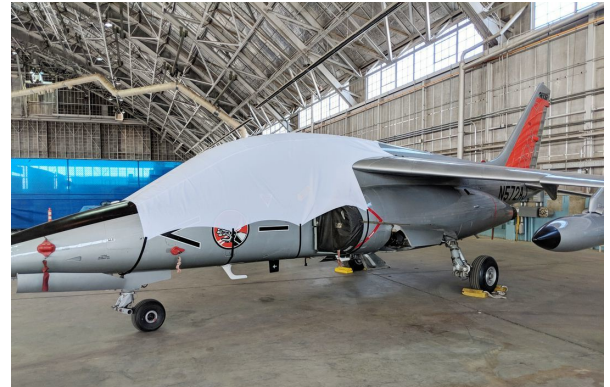
Dornier Alpha Jet Canopy Cover, test fit cover