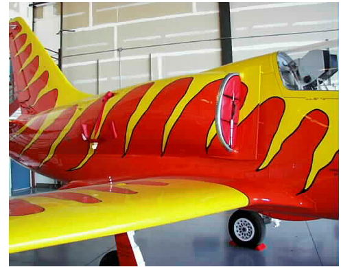
Inlet Plug, folding type