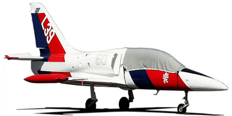
Canopy Cover for Aero L-39 Albatros