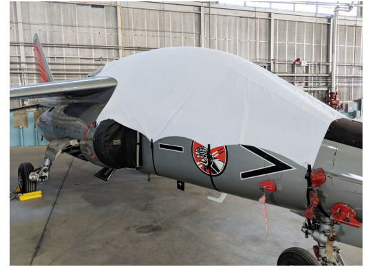
Dornier Alpha Jet Canopy Cover, test fit cover