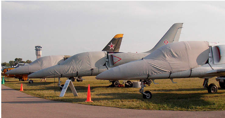
L-39 Canopy/Nose Covers & Plugs

This cover type is made from Silver Acrylic Sunbrella canvas and is 100% lined with a soft and smooth microfiber. Bruce's Custom Covers developed this material combination especially for aircraft protection. The outer material is medium weight and treated for water resistance, UV resistance and anti-static buildup. The inner lining is a very soft and smooth microfiber to prevent scratching. The material is very reflective, and tests show that the cabin interior temperature can be reduced to near-ambient temperature on the hottest of days. It is water, ice and snow repellent, yet breathable to allow moisture to escape from between the cover and the aircraft surface.