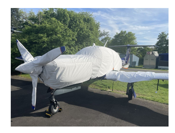
Diamond DA-50 Extended Canopy/Engine, Prop & Wing Covers (test fit)

This cover type is made from Silver Acrylic Sunbrella canvas and is 100% lined with a soft and smooth microfiber. Bruce's Custom Covers developed this material combination especially for aircraft protection. The outer material is medium weight and treated for water resistance, UV resistance and anti-static buildup. The inner lining is a very soft and smooth microfiber to prevent scratching. The material is very reflective, and tests show that the cabin interior temperature can be reduced to near-ambient temperature on the hottest of days. It is water, ice and snow repellent, yet breathable to allow moisture to escape from between the cover and the aircraft surface.