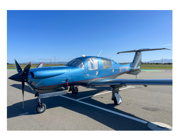
Diamond DA-50 HeatShield Set