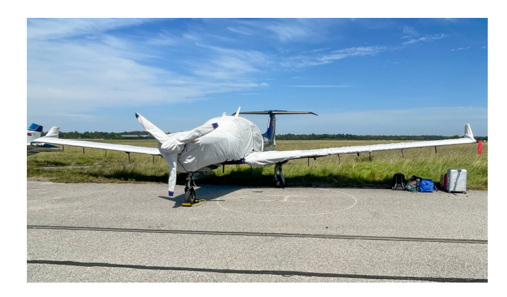
Diamond DA-50 Extended Canopy/Engine Cover, Wing & Prop Covers