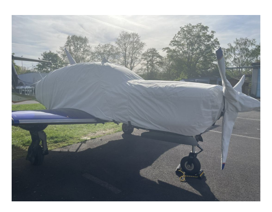
Diamond DA-50 Extended Canopy/Engine, Prop & Wing Covers Diamond DA-50 Extended Canopy/Engine, Prop & Wing Covers (test fit) (test fit)