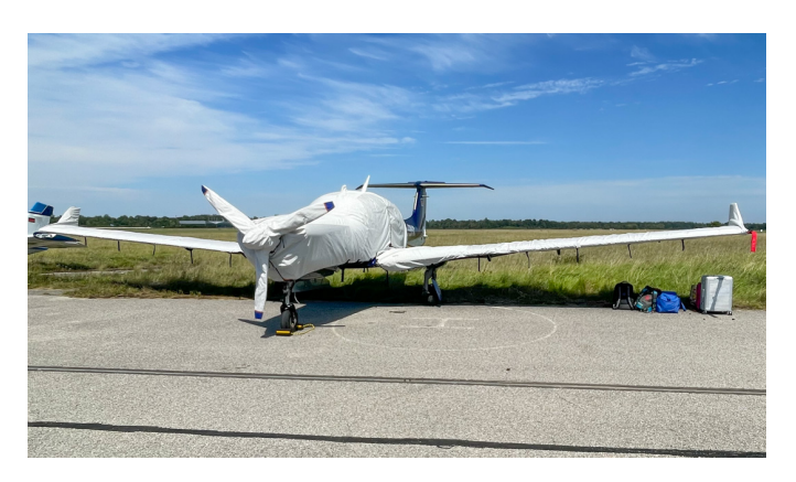
Diamond DA-50 Extended Canopy/Engine Cover, Wing & Prop Covers