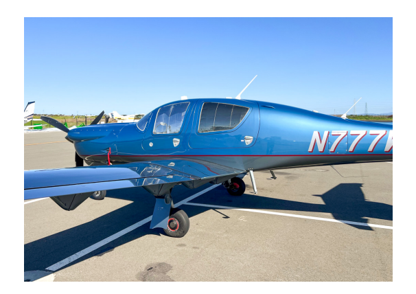
Diamond DA-50 HeatShield Set

Cabin Heatshields are interior sunshades for the aircraft's passenger cabin area. The product is a unique composite of closed-cell foam with a silver mylar finish. The semi-rigid design is stiff enough to stand inside the window framing. The set folds up flat and is easily stored in the included storage sleeve. Some designs may require velcro and suction cups. A Heatshield is an excellent short-term remedy for cockpit overheating, but an external fabric cover is more effective for long-term protection.