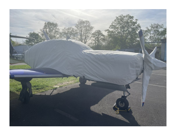
Diamond DA-50 Extended Canopy/Engine, Prop & Wing Covers (test fit)

This cover type is made from Silver Acrylic Sunbrella canvas and is 100% lined with a soft and smooth microfiber. Bruce's Custom Covers developed this material combination especially for aircraft protection. The outer material is medium weight and treated for water resistance, UV resistance and anti-static buildup. The inner lining is a very soft and smooth microfiber to prevent scratching. The material is very reflective, and tests show that the cabin interior temperature can be reduced to near-ambient temperature on the hottest of days. It is water, ice and snow repellent, yet breathable to allow moisture to escape from between the cover and the aircraft surface.