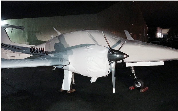
Diamond DA-42 Twin Star Wing & Engine Covers

WINTER USE MATERIAL - Made with Solution-Dyed Polyester fabric, this option is intended for seasonal use to aid in deicing, rain mitigation, or for occasional travel. The material is lighter and more compact, but more susceptible to UV damage and may have a shorter useful life if used continuously outside than the all-year use material.