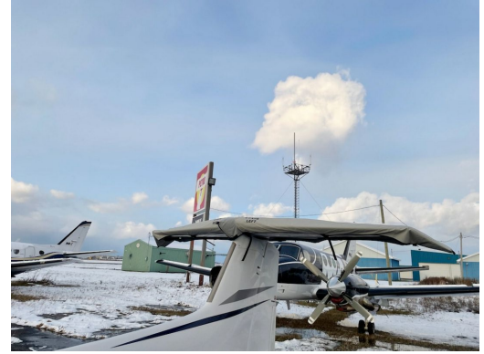
Diamond DA-42 Horizontal Stabilizer Cover