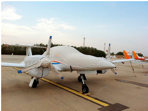
Diamond DA-42NG Canopy/Nose, Engine & Prop Covers

The material is very reflective, and tests show that the cabin interior temperature can be reduced to near-ambient temperature on the hottest of days. It is water, ice and snow repellent, yet breathable to allow moisture to escape from between the cover and the aircraft surface.