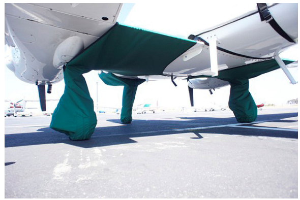
Twinstar Landing Gear & Gearwell Covers