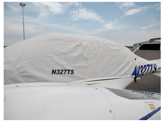
Diamone DA-42 Twin Star Canopy Cover