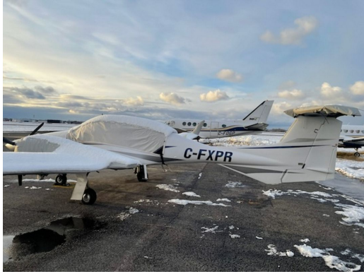
Diamond DA-42 Canopy, Wing, Engine & Horizontal Stabilizer Covers

WINTER USE MATERIAL - Made with Solution-Dyed Polyester fabric, this option is intended for seasonal use to aid in deicing, rain mitigation, or for occasional travel. The material is lighter and more compact, but more susceptible to UV damage and may have a shorter useful life if used continuously outside than the all-year use material.