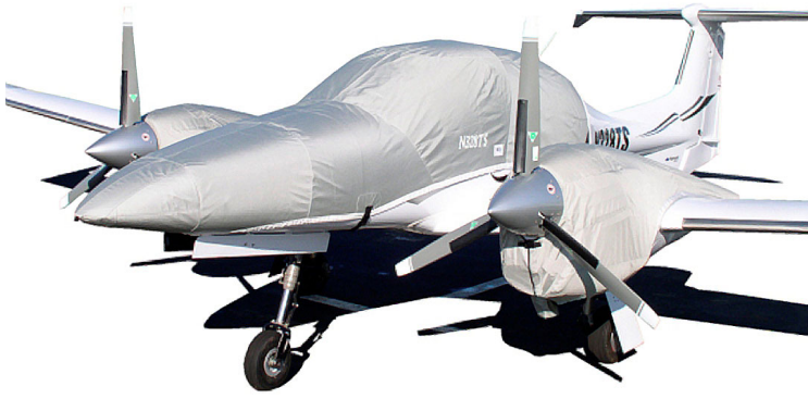
Diamond Twinstar Canopy/Nose Cover & Engine Covers