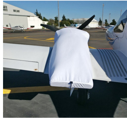
DA42 MPP Guardian (DA42-NG) Engine Cover, test fit cover