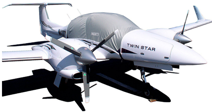
Twinstar Standard Canopy Cover