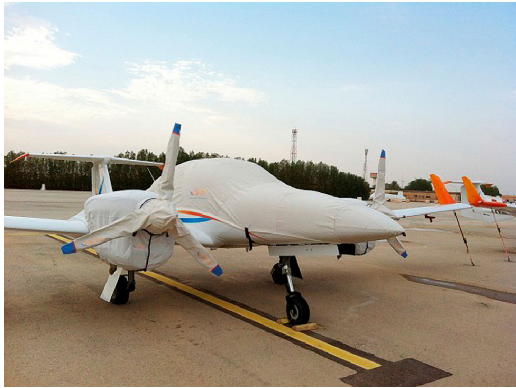
Diamond DA-42NG Canopy/Nose, Engine & Prop Covers

The material is very reflective, and tests show that the cabin interior temperature can be reduced to near-ambient temperature on the hottest of days. It is water, ice and snow repellent, yet breathable to allow moisture to escape from between the cover and the aircraft surface.