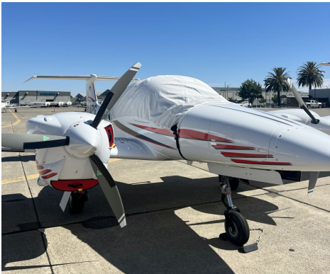
Diamond DA-42 Twin Star Canopy Cover