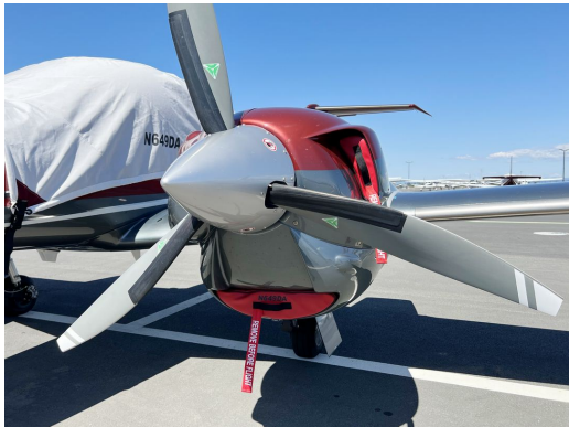
Diamond DA-42 Engine Inlet Plugs

Engine Inlet Plugs are custom fit for your Diamond DA-42 Twin Star intakes, made with heavy-duty vinyl material, and stuffed with a single block of sculpted urethane foam. Each plug has a zipper that allows the foam to be removed and dried if necessary. Engine plugs have warning flags that are visible from the cockpit or 'remove before flight' streamers sewn onto the face of the plugs. Most plugs are imprinted with the aircraft registration number in black for an extra charge. Storage bag NOT included. Engine plugs may be inserted after flight when the engine is still warm. Engine Inlet Plugs are commonly referred to as Cowl Plugs, Intake Plugs, Cowl Blocks, Engine Blocks, and Engine Bungs.