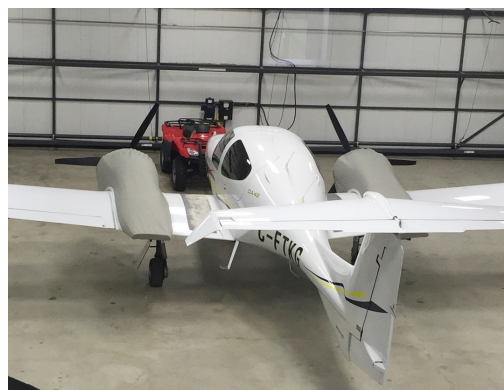
Diamond DA-42 Twinstar Engine Covers