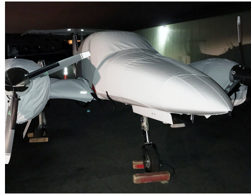
Diamond DA-42 Twin Star Wing & Engine Covers