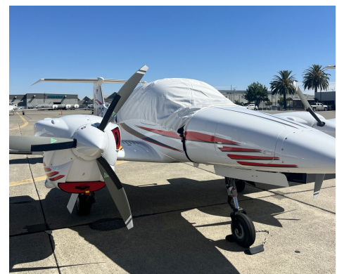
Diamond DA-42 Twin Star Canopy Cover