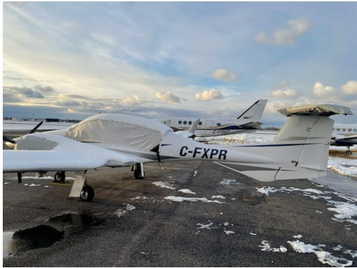
Diamond DA-42 Canopy, Wing, Engine & Horizontal Stabilizer Covers