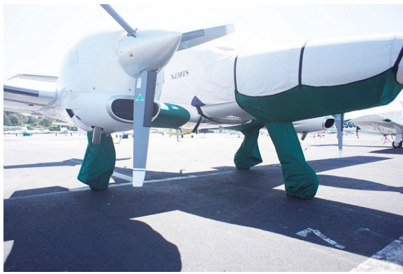
Twinstar Landing Gear & Gearwell Covers