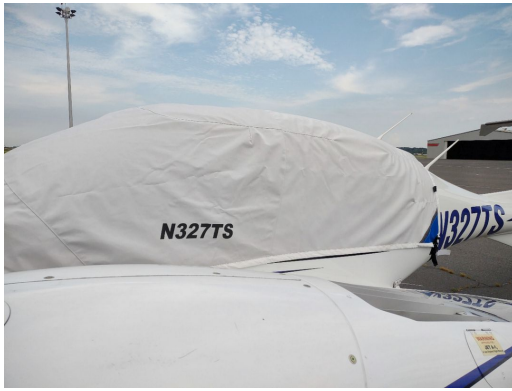
Diamone DA-42 Twin Star Canopy Cover