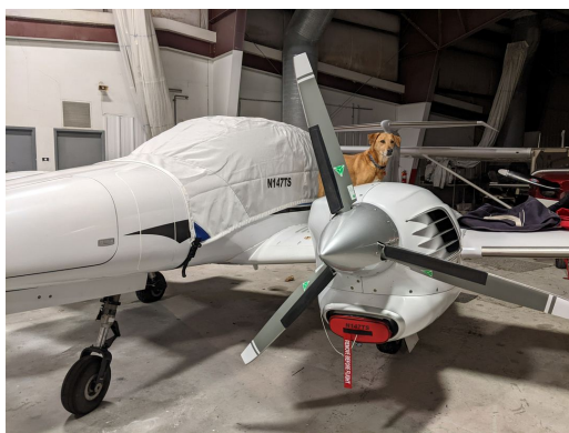
Diamond DA-42 NG Canopy Cover, Engine Plugs

Engine Inlet Plugs are custom fit for your Diamond DA-42 Twin Star intakes, made with heavy-duty vinyl material, and stuffed with a single block of sculpted urethane foam. Each plug has a zipper that allows the foam to be removed and dried if necessary. Engine plugs have warning flags that are visible from the cockpit or 'remove before flight' streamers sewn onto the face of the plugs. Most plugs are imprinted with the aircraft registration number in black for an extra charge. Storage bag NOT included. Engine plugs may be inserted after flight when the engine is still warm. Engine Inlet Plugs are commonly referred to as Cowl Plugs, Intake Plugs, Cowl Blocks, Engine Blocks, and Engine Bungs.