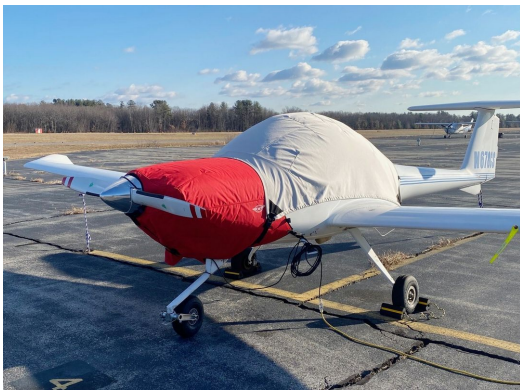
Diamond DA20-C1 Insulated Engine Cover, C1 models

This cover type is made from Silver Acrylic Sunbrella canvas and is 100% lined with a soft and smooth microfiber. Bruce's Custom Covers developed this material combination especially for aircraft protection. The outer material is medium weight and treated for water resistance, UV resistance and anti-static buildup. The inner lining is a very soft and smooth microfiber to prevent scratching. The material is very reflective, and tests show that the cabin interior temperature can be reduced to near-ambient temperature on the hottest of days. It is water, ice and snow repellent, yet breathable to allow moisture to escape from between the cover and the aircraft surface.