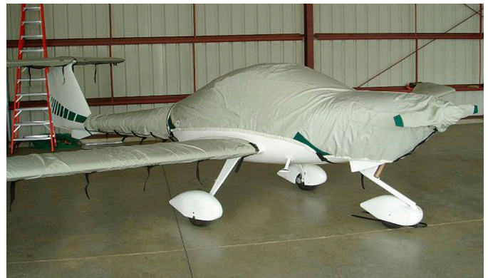
DA-20 Canopy/Engine, Prop/Spinner, Wing, Tailboom, Horiz. Stab. Covers