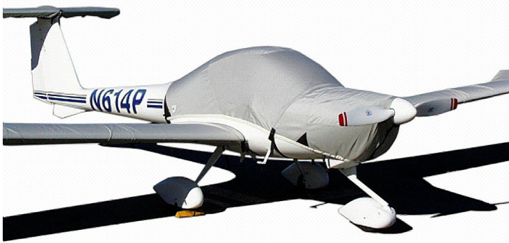
Diamond DA-20 Canopy/Engine, Wing & Horiz. Stab. Covers

This cover type is made from Silver Acrylic Sunbrella canvas and is 100% lined with a soft and smooth microfiber. Bruce's Custom Covers developed this material combination especially for aircraft protection. The outer material is medium weight and treated for water resistance, UV resistance and anti-static buildup. The inner lining is a very soft and smooth microfiber to prevent scratching. The material is very reflective, and tests show that the cabin interior temperature can be reduced to near-ambient temperature on the hottest of days. It is water, ice and snow repellent, yet breathable to allow moisture to escape from between the cover and the aircraft surface.