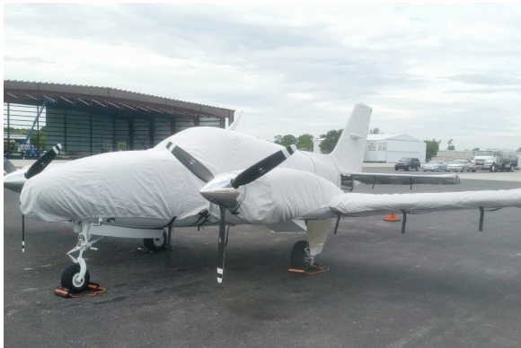
Full Cover Set (58P-020, 58P-225, 58P-405)