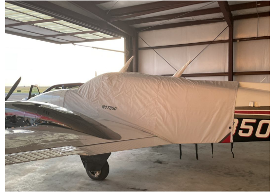
Beech Baron 58TC Extended Canopy Cover