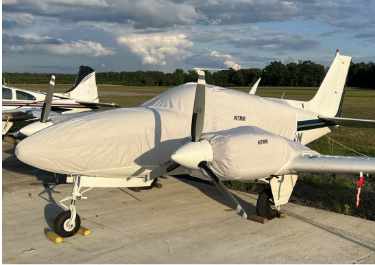
Beech C55 Baron Extended Canopy/Nose Cover, Engine Covers

The material is very reflective, and tests show that the cabin interior temperature can be reduced to near-ambient temperature on the hottest of days. It is water, ice and snow repellent, yet breathable to allow moisture to escape from between the cover and the aircraft surface.