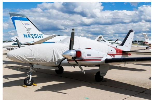
Beech Baron D55 Canopy/Nose Cover