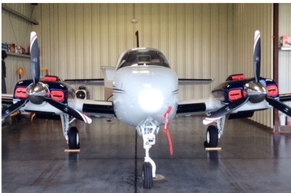
Beech Baron 58 Engine Inlet Plugs, Cowl Top Plugs, Heater Inlet, Pitot Cover

Engine Inlet Plugs are custom fit for your Beech Baron D55 & E55 intakes, made with heavy-duty vinyl material, and stuffed with a single block of sculpted urethane foam. Each plug has a zipper that allows the foam to be removed and dried if necessary. Engine plugs have warning flags that are visible from the cockpit or 'remove before flight' streamers sewn onto the face of the plugs. Most plugs are imprinted with the aircraft registration number in black for an extra charge. Storage bag NOT included. Engine plugs may be inserted after flight when the engine is still warm. Engine Inlet Plugs are commonly referred to as Cowl Plugs, Intake Plugs, Cowl Blocks, Engine Blocks, and Engine Bungs.