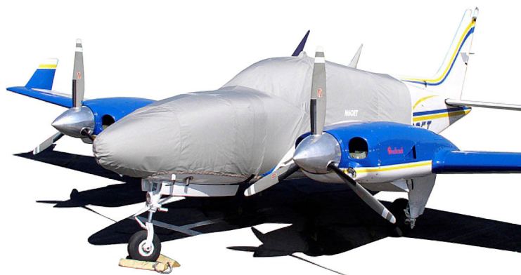
Baron Canopy/Nose Cover