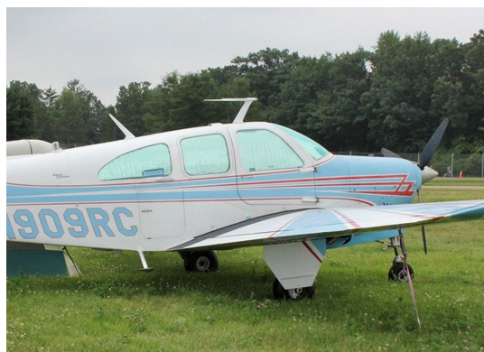
Beech Bonanza/Debonair HeatShield Set