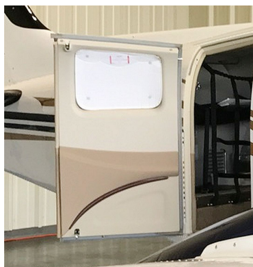
Beech Baron 58 Cabin HeatShield