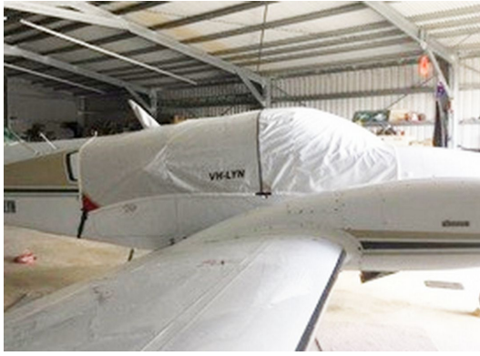
Beech Baron B-55 Canopy Cover