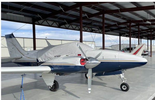
Beech Baron D55 Canopy Cover, Engine Plugs

This cover type is made from Silver Acrylic Sunbrella canvas and is 100% lined with a soft and smooth microfiber. Bruce's Custom Covers developed this material combination especially for aircraft protection. The outer material is medium weight and treated for water resistance, UV resistance and anti-static buildup. The inner lining is a very soft and smooth microfiber to prevent scratching. The material is very reflective, and tests show that the cabin interior temperature can be reduced to near-ambient temperature on the hottest of days. It is water, ice and snow repellent, yet breathable to allow moisture to escape from between the cover and the aircraft surface.