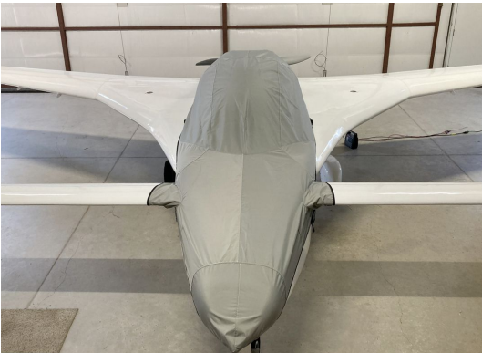
COZY Mk IV Lightweight Travel Canopy/Nose/Engine Cover

Travel Covers are made with Silver Solution-Dyed Polyester fabric and only lined over the windshield to save weight. The material is lightweight and more compact for easy stowage in the aircraft. The polyester material is water resistant, but only intended for occasional use outside. We also have an ultra lightweight material available for fitted hangar dust covers. For daily outdoor use, the non-travel Sunbrella Cover is the best choice.