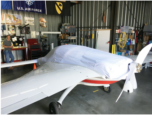
Cozy Canopy/Nose/Engine Cover, test fit cover

water resistance, UV resistance and anti-static buildup. The inner lining is a very soft and smooth microfiber to prevent scratching. The material is very reflective, and tests show that the cabin interior temperature can be reduced to near-ambient temperature on the hottest of days. It is water, ice and snow repellent, yet breathable to allow moisture to escape from between the cover and the aircraft surface.