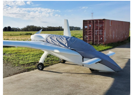
Cozy Travel Weight Canopy/Nose Cover