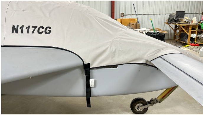
Cozy All Models Canopy/Nose/Engine Cover, Mark Iii & Iv Models

water resistance, UV resistance and anti-static buildup. The inner lining is a very soft and smooth microfiber to prevent scratching. The material is very reflective, and tests show that the cabin interior temperature can be reduced to near-ambient temperature on the hottest of days. It is water, ice and snow repellent, yet breathable to allow moisture to escape from between the cover and the aircraft surface.