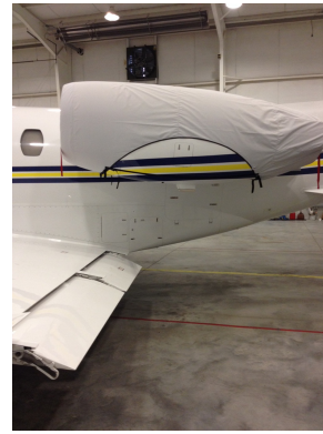
Cessna Citation 560XL Upper Nacelle/Brightwork Covers