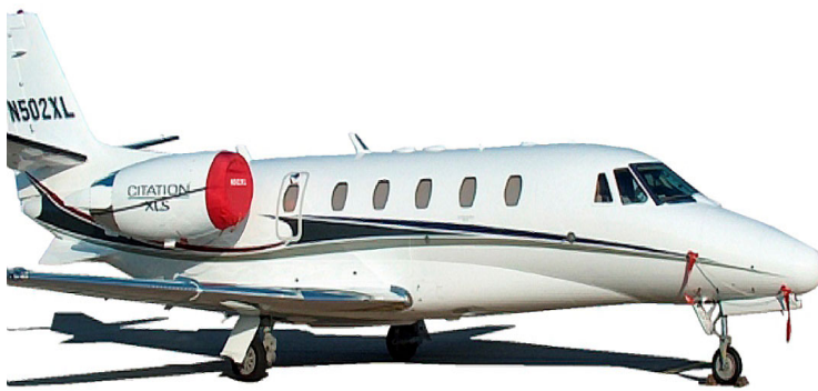
Citation 560XL Engine Intake Covers