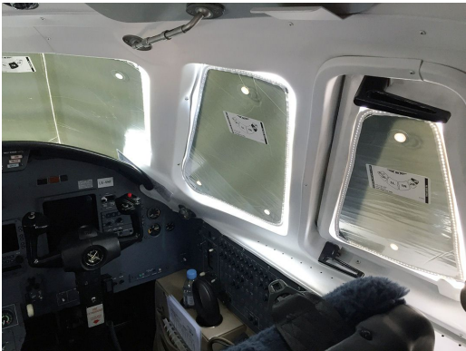
Cessna Citation XL, XLS (560XL) Cockpit Heatshields

Cockpit Heatshields are interior sunshades for the aircraft's cockpit. The product is a unique composite of closed-cell foam with a silver mylar finish. The semi-rigid design is stiff enough to stand inside the window framing. The set folds up flat and is easily stored in the included storage sleeve. Some designs may require velcro and suction cups. Our Heatshields for jets are offered white side out because some aircraft manufacturers have issued advisories against reflective window inserts due to potential heat damage. A Heatshield is an excellent short-term remedy for cockpit overheating, but an external fabric cover is more effective for long-term protection.