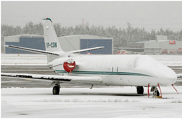
Cessna 560 Engine Inlet/Exhaust Covers, Pitot Cover Set