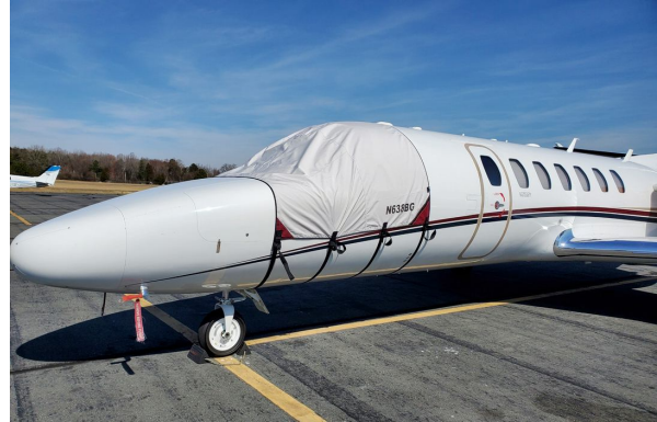
Cessna Citation 560 Cockpit Cover