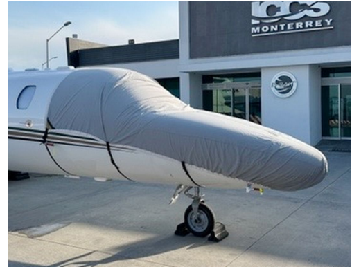
Cessna Citationjet 525B Travel Weight Cockpit/Nose Cover