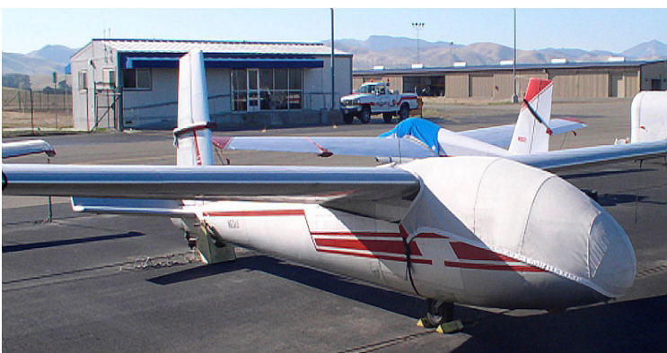
Blanik L13 Canopy/Nose Cover