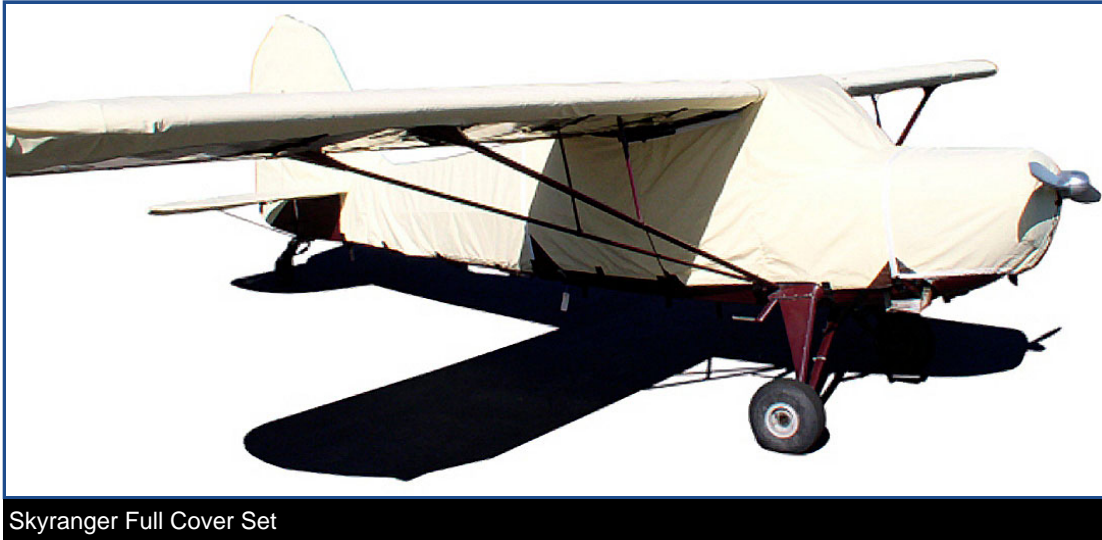
Skyranger Full Cover Set