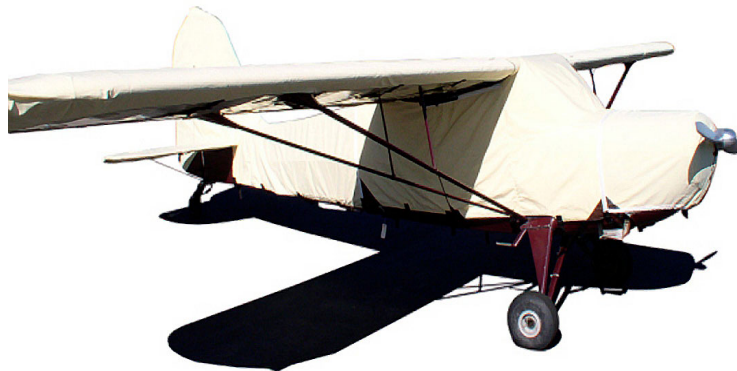
Skyranger Full Cover Set

This cover type is made from Silver Acrylic Sunbrella canvas and is 100% lined with a soft and smooth microfiber. Bruce's Custom Covers developed this material combination especially for aircraft protection. The outer material is medium weight and treated for water resistance, UV resistance and anti-static buildup. The inner lining is a very soft and smooth microfiber to prevent scratching. The material is very reflective, and tests show that the cabin interior temperature can be reduced to near-ambient temperature on the hottest of days. It is water, ice and snow repellent, yet breathable to allow moisture to escape from between the cover and the aircraft surface.