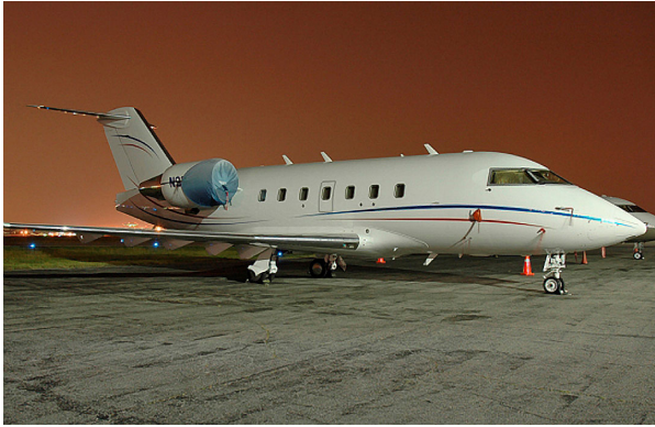
Challenger 601 Intake Covers, standard design

The Canadair Regional Jet 200, 700 Bikini Style Engine Covers are a single-piece design using a soft and smooth stretchy and fabric. The cover stretches tightly over both the intake and exhaust, installing quickly and easily. These covers are designed to be used as hangar dust covers and have a useful life of approximately one year.