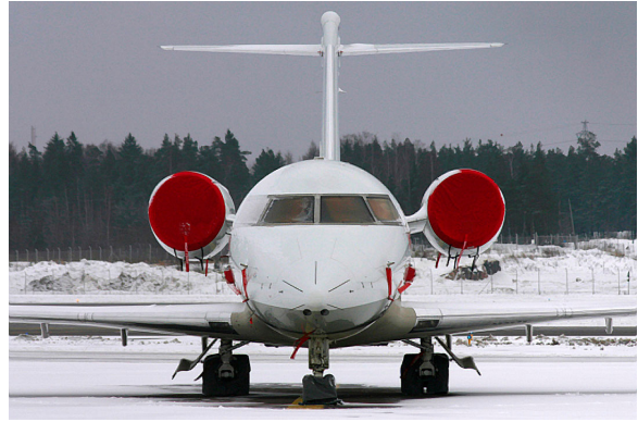
Challenger 604 Intake Covers, OEM design