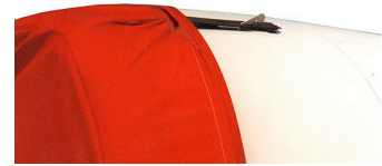
Alternate Intake Cover Design