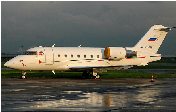
Challenger 604 Intake Covers, OEM design