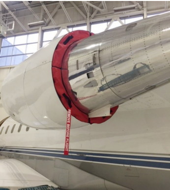
Canadair Challenger 604 Bypass Plugs