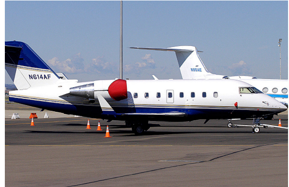
Challenger 604 Intake Covers, standard design