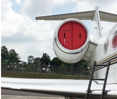
Grumman Gulfstream G450 Intake Plugs

The Engine Inlet Plugs are custom fit for your Canadair Regional Jet 200, 700 intakes, made with heavy-duty vinyl material, and stuffed with a single block of sculpted urethane foam. Each plug has a zipper that allows the foam to be removed and dried if necessary. Engine plugs have 'remove before flight' streamers sewn onto the face of the plugs. Most plugs are imprinted with the aircraft registration number in black for an extra charge. Storage bag NOT included. Engine plugs may be inserted after flight when the engine is still warm. Engine Inlet Plugs are commonly referred to as Cowl Plugs, Intake Plugs, Cowl Blocks, Engine Blocks, and Engine Bungs.