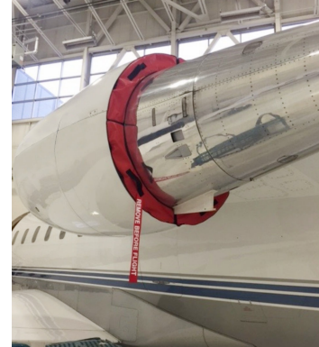
Canadair Challenger 604 Bypass Plugs