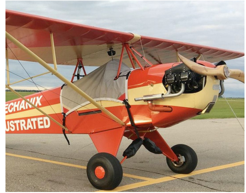
Corben Baby Ace Cockpit Cover