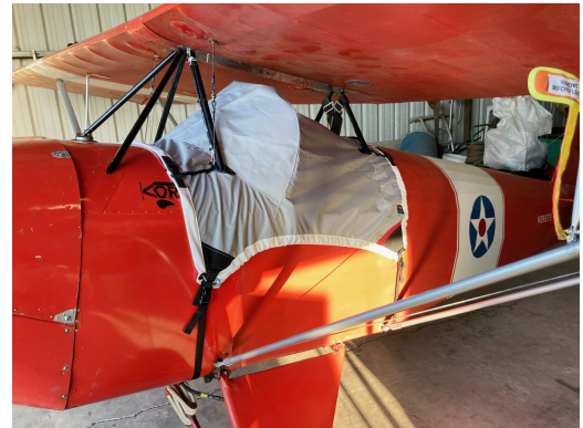
Corben Junior Ace Travel Weight Canopy Cover