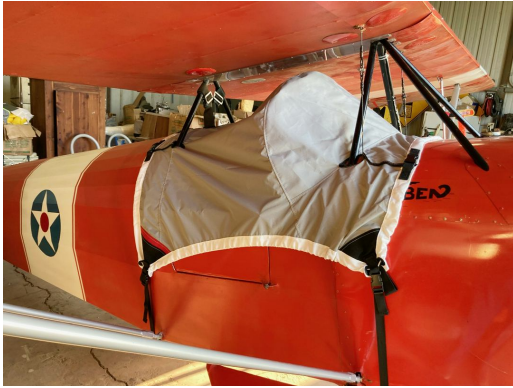
Corben Junior Ace Travel Weight Canopy Cover