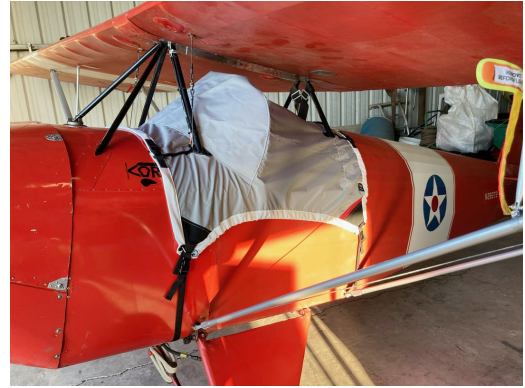
Corben Junior Ace Travel Weight Canopy Cover