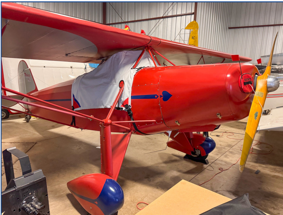
Corben Baby Ace, Junior Ace, and similar models Cockpit Cover