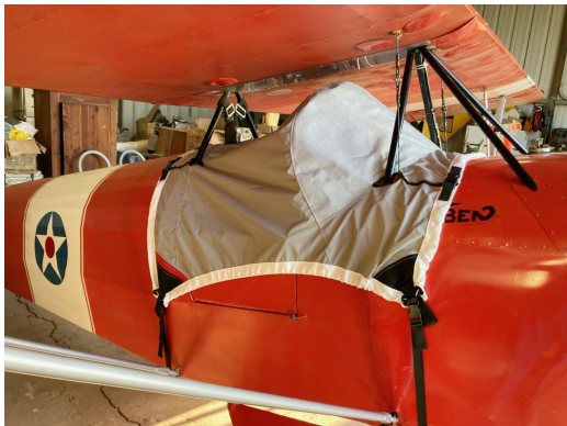
Corben Junior Ace Travel Weight Canopy Cover

This cover type is made from Silver Acrylic Sunbrella canvas and is 100% lined with a soft and smooth microfiber. Bruce's Custom Covers developed this material combination especially for aircraft protection. The outer material is medium weight and treated for water resistance, UV resistance and anti-static buildup. The inner lining is a very soft and smooth microfiber to prevent scratching. The material is very reflective, and tests show that the cabin interior temperature can be reduced to near-ambient temperature on the hottest of days. It is water, ice and snow repellent, yet breathable to allow moisture to escape from between the cover and the aircraft surface.