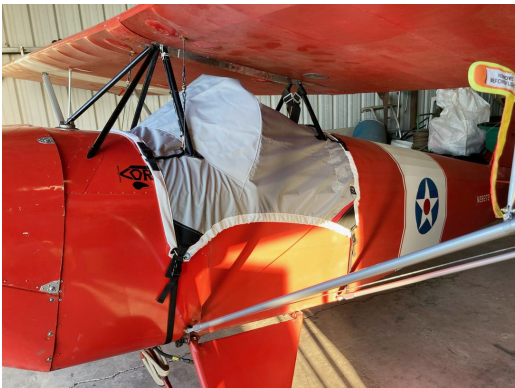
Corben Junior Ace Travel Weight Canopy Cover