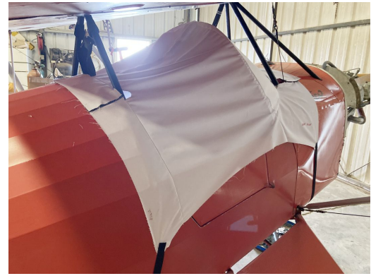
Corben Junior Ace Cockpit Cover, test fit cover