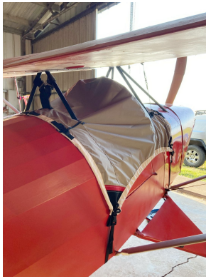
Corben Junior Ace Travel Weight Canopy Cover