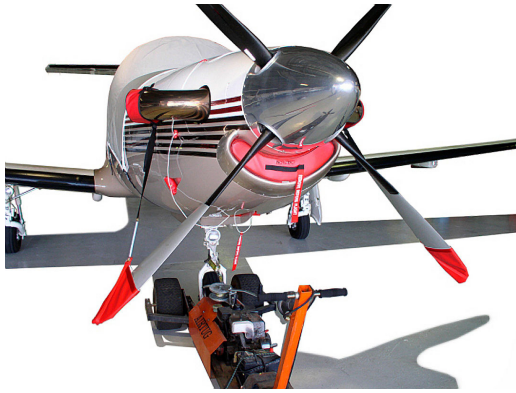
Pilatus PC-12 LARGE ENGINE INLET PLUG, SMALL PLUGS SET, Prop Tie/Exhaust Covers

water resistance, UV resistance and anti-static buildup. The inner lining is a very soft and smooth microfiber to prevent scratching. The material is very reflective, and tests show that the cabin interior temperature can be reduced to near-ambient temperature on the hottest of days. It is water, ice and snow repellent, yet breathable to allow moisture to escape from between the cover and the aircraft surface.