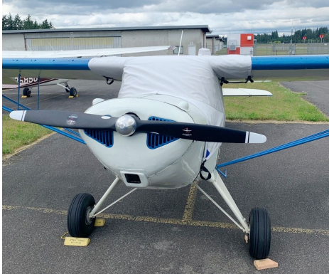
Taylorcraft Models F19 Over-The-Top Canopy Cover

This cover type is made from Silver Acrylic Sunbrella canvas and is 100% lined with a soft and smooth microfiber. Bruce's Custom Covers developed this material combination especially for aircraft protection. The outer material is medium weight and treated for water resistance, UV resistance and anti-static buildup. The inner lining is a very soft and smooth microfiber to prevent scratching. The material is very reflective, and tests show that the cabin interior temperature can be reduced to near-ambient temperature on the hottest of days. It is water, ice and snow repellent, yet breathable to allow moisture to escape from between the cover and the aircraft surface.