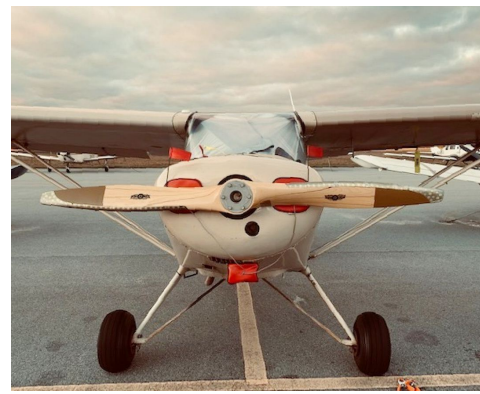
Taylorcraft Engine Inlet Plugs