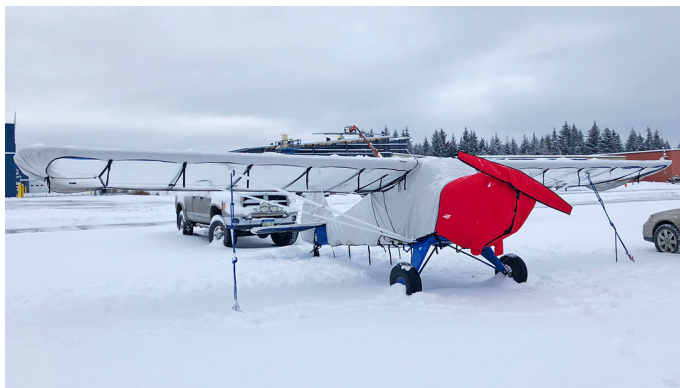
Taylorcraft Aviation Corp F19 Insulated Engine Cover

This cover type is made from Silver Acrylic Sunbrella canvas and is 100% lined with a soft and smooth microfiber. Bruce's Custom Covers developed this material combination especially for aircraft protection. The outer material is medium weight and treated for water resistance, UV resistance and anti-static buildup. The inner lining is a very soft and smooth microfiber to prevent scratching. The material is very reflective, and tests show that the cabin interior temperature can be reduced to near-ambient temperature on the hottest of days. It is water, ice and snow repellent, yet breathable to allow moisture to escape from between the cover and the aircraft surface.