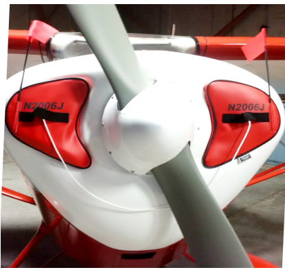
Taylorcraft Engine Inlet Plugs