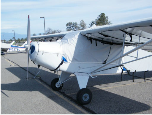
Taylorcraft Over-Top Canopy Cover & Wing Covers

WINTER USE MATERIAL - Made with Solution-Dyed Polyester fabric, this option is intended for seasonal use to aid in deicing, rain mitigation, or for occasional travel. The material is lighter and more compact, but more susceptible to UV damage and may have a shorter useful life if used continuously outside than the all-year use material.