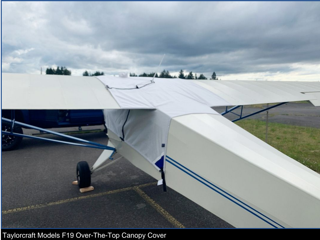
Taylorcraft Models F19 Over-The-Top Canopy Cover