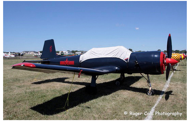
CJ-6 Nanchang Canopy Cover