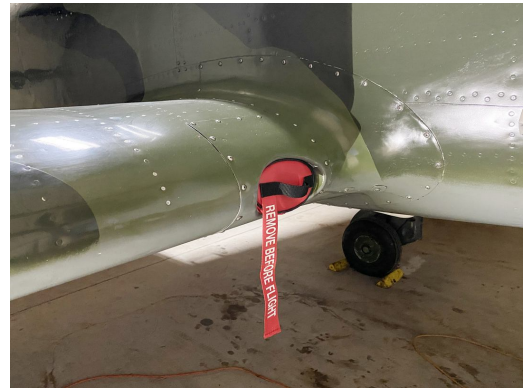
Nanchang CJ-6A Leading Edge Plug