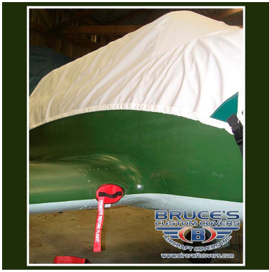
CJ6 Canopy Cover & Leading Edge Inlet Plug