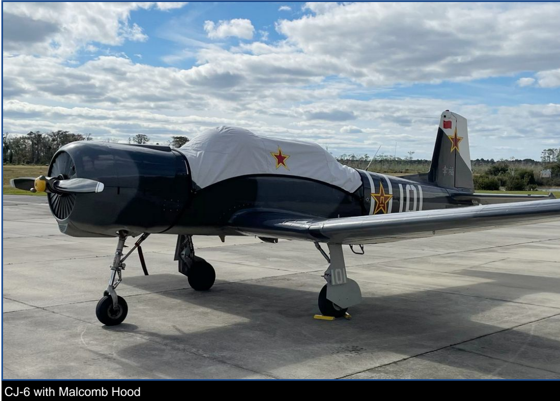
CJ-6 with Malcomb Hood