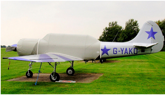
Yak 52 Extended Canopy, Engine & Horiz. Stab. Covers