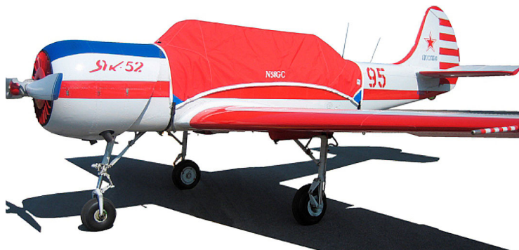
Yak 52 Canopy Cover