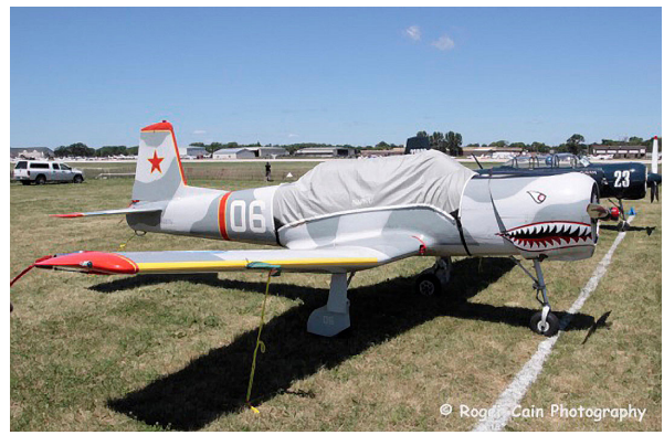
CJ-6 Nanchang Canopy Cover