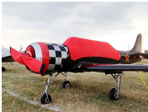
Yak 52 Canopy Cover & Prop Cover