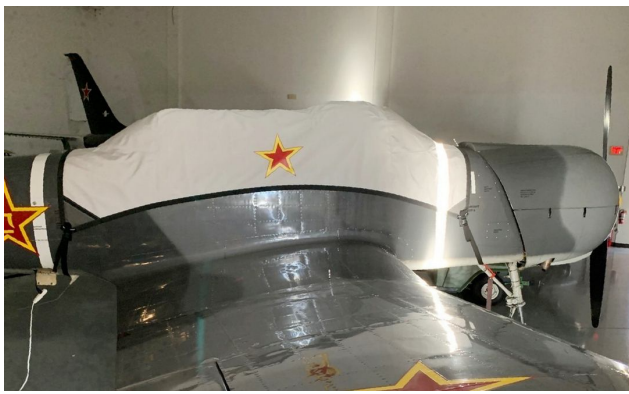
Canopy Cover for Malcom Hood with Custom Artwork.