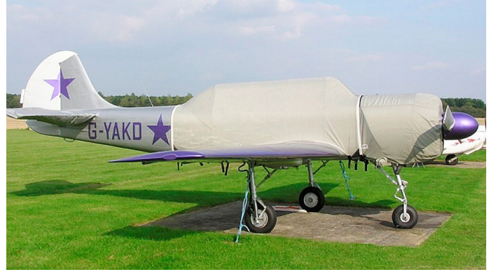
Yak 52 Extended Canopy, Engine & Horiz. Stab. Covers