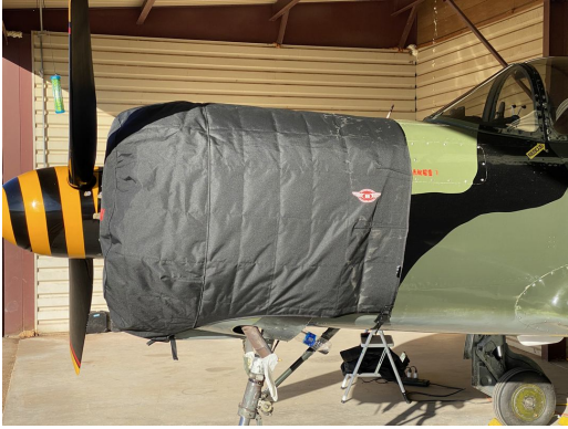
Nanchang CJ6 Insulated Engine Cover

The material is very reflective, and tests show that the cabin interior temperature can be reduced to near-ambient temperature on the hottest of days. It is water, ice and snow repellent, yet breathable to allow moisture to escape from between the cover and the aircraft surface.