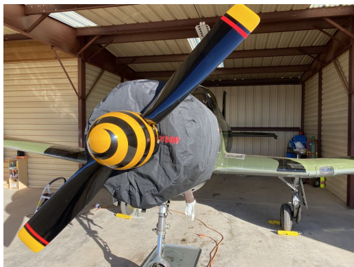
Nanchang CJ6 Insulated Engine Cover

The material is very reflective, and tests show that the cabin interior temperature can be reduced to near-ambient temperature on the hottest of days. It is water, ice and snow repellent, yet breathable to allow moisture to escape from between the cover and the aircraft surface.