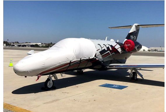
Citationjet CJ1 Cockpit/Nose Cover