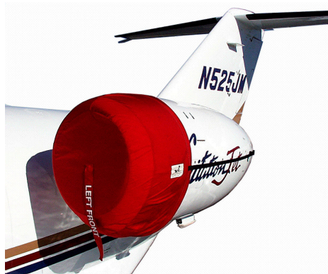
Engine Inlet Cover