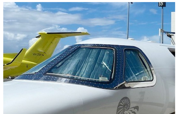
Cessna Citationjet CJ2 Cockpit HeatShields