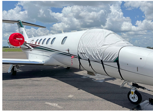
Cessna Citationjet 525C, CJ-4 Pitot, Aoa Cover Set, Heat Resistant Type