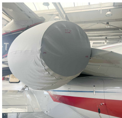
Citationjet 525C, CJ4, Complete Nacelle Cover, light weight Spandex