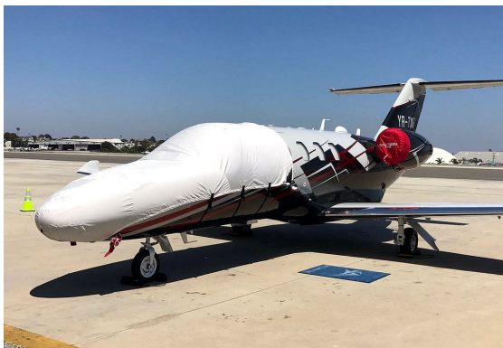
Citationjet CJ1 Cockpit/Nose Cover

This cover type is made from Silver Acrylic Sunbrella canvas and is 100% lined with a soft and smooth microfiber. Bruce's Custom Covers developed this material combination especially for aircraft protection. The outer material is medium weight and treated for water resistance, UV resistance and anti-static buildup. The inner lining is a very soft and smooth microfiber to prevent scratching. The material is very reflective, and tests show that the cabin interior temperature can be reduced to near-ambient temperature on the hottest of days. It is water, ice and snow repellent, yet breathable to allow moisture to escape from between the cover and the aircraft surface.