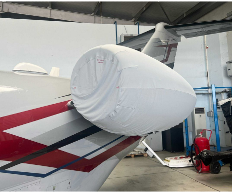
Citationjet 525C, CJ4, Complete Nacelle Cover, light weight Spandex