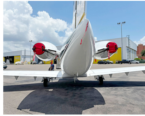
Cessna Citationjet 525C, CJ-4 Engine Inlet Covers & Exhaust Plugs